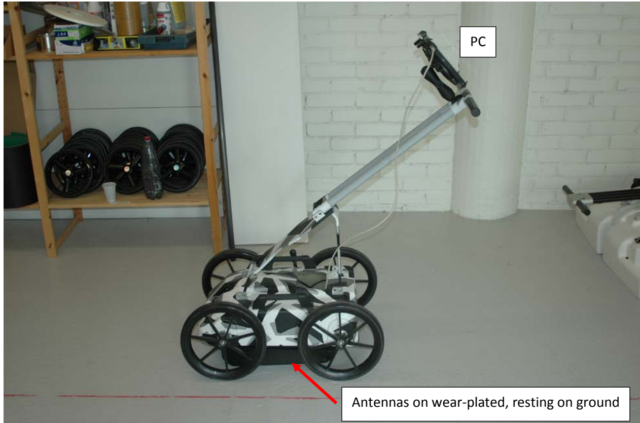
Example configuration, ready for operation. Antennas placed on wear-plate directed towards ground, and wear plate hooked up to trolley.