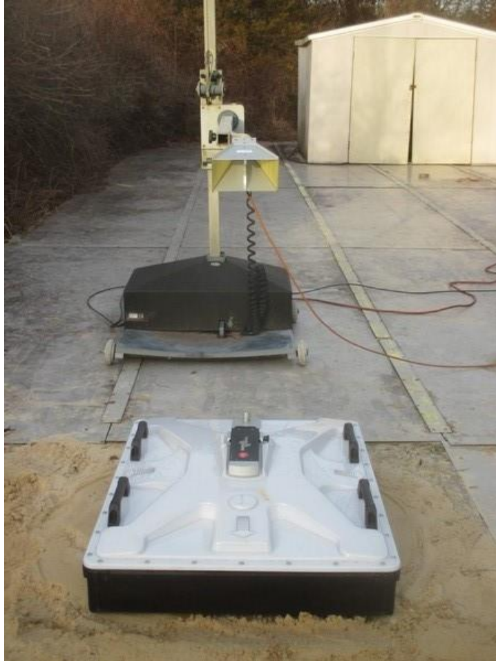
Above 1GHz ( 1m measurement for low emission signals)