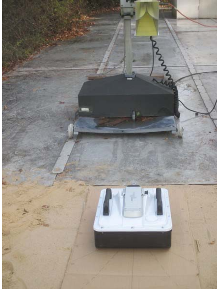
Above 1GHz ( 1m measurement for low emission signals)