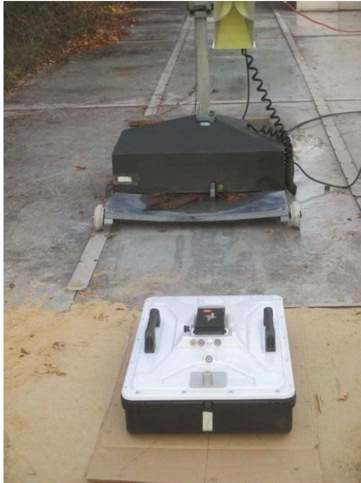
Above 1GHz ( 1m measurement for low emission signals)