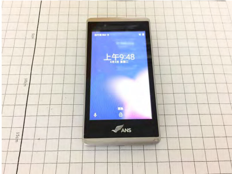
Fig. 3 Front view of EUT