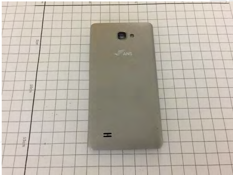
Fig. 4 Back view of EUT