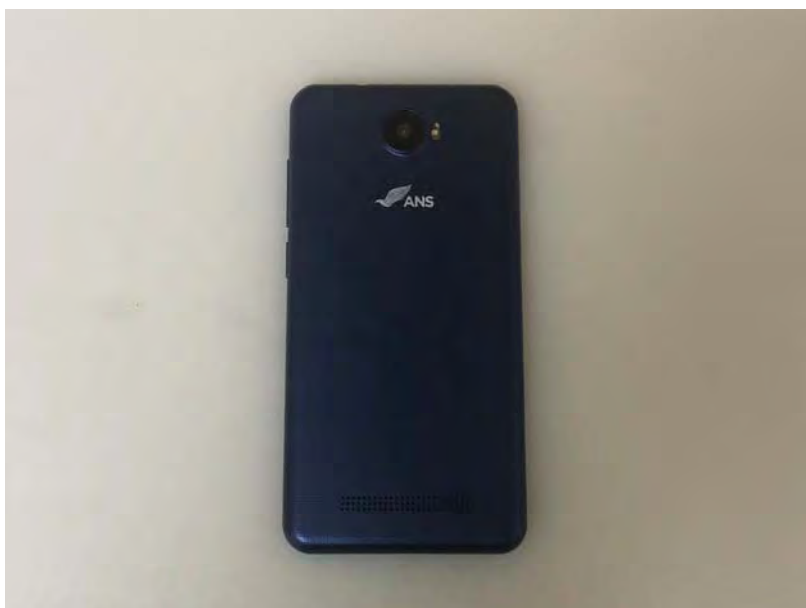
Fig. 4 Back view of EUT