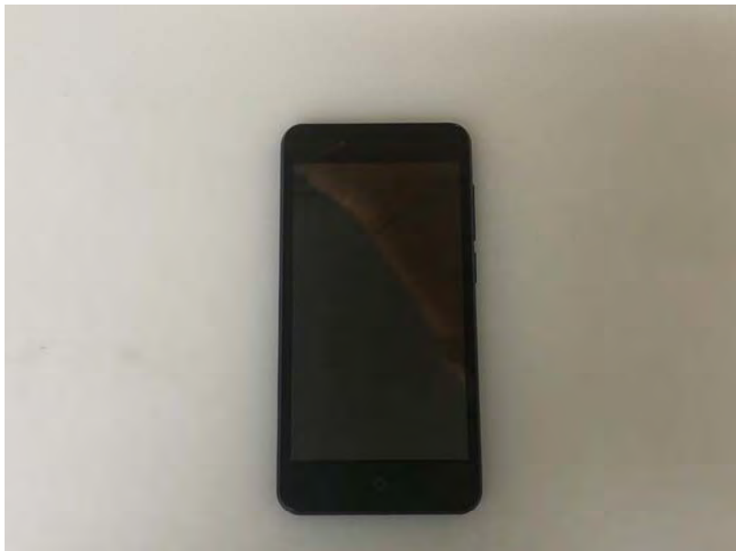
Fig. 3 Front view of EUT