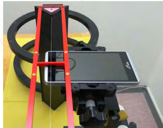
Fig. 2 Receiver of mobile contact center of Arch

Unless otherwise stated the results shown in this test report refer only to the sample(s) tested and such sample(s) are retained for 90 days only. This document is issued by the Company subject to its General Conditions of Service printed overleaf, available on request or accessible at www.sgs.com/terms_and_conditions.htm and for electronic format documents, subject to Terms and Conditions for Electronic Documents at www.sgs.com/terms_e-document.htm . Attention is drawn to the limitation of liability, indemnification and jurisdiction issues defined therein. Any holder of this document is advised that information contained herein reflects the Company's findings at the time of its intervention only and within the limits of Client's instructions, if any. The Company's sole responsibility is to its Client and this document does not exonerate parties to a transaction from exercising all their rights and obligations under the transaction documents. This document cannot be reproduced except in full, without prior written approval of the Company. Any unauthorized alteration, forgery or falsification of the content or appearance of this document is unlawful and offenders may be prosecuted to the fullest extent of the law.