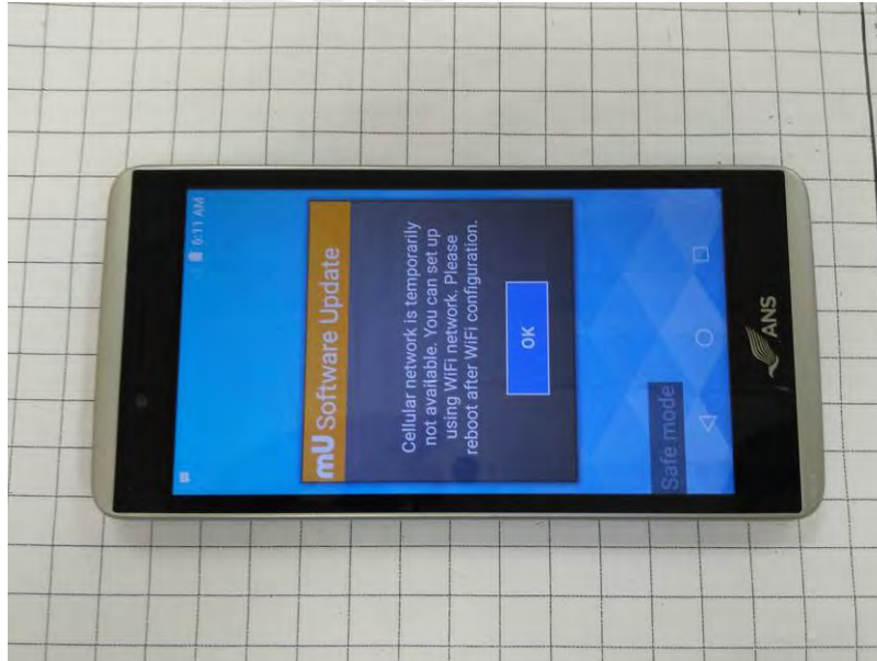
Fig. 3 Front view of EUT