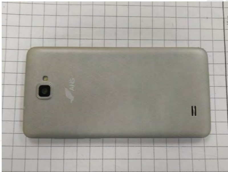
Fig. 4 Back view of EUT