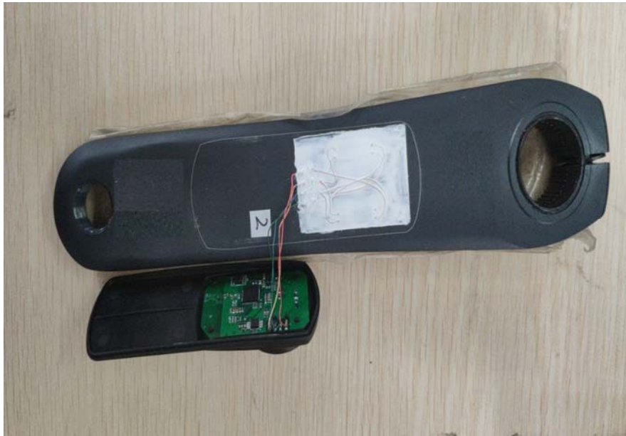
EUT – Cover off PCB Top View