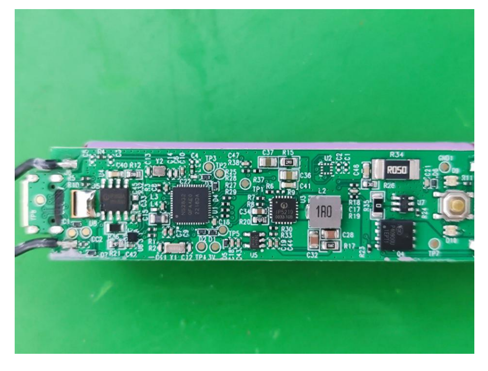
INTERNAL PHOTO OF SAMPLE PCB