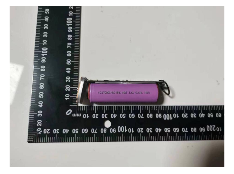
INTERNAL PHOTO OF SAMPLE