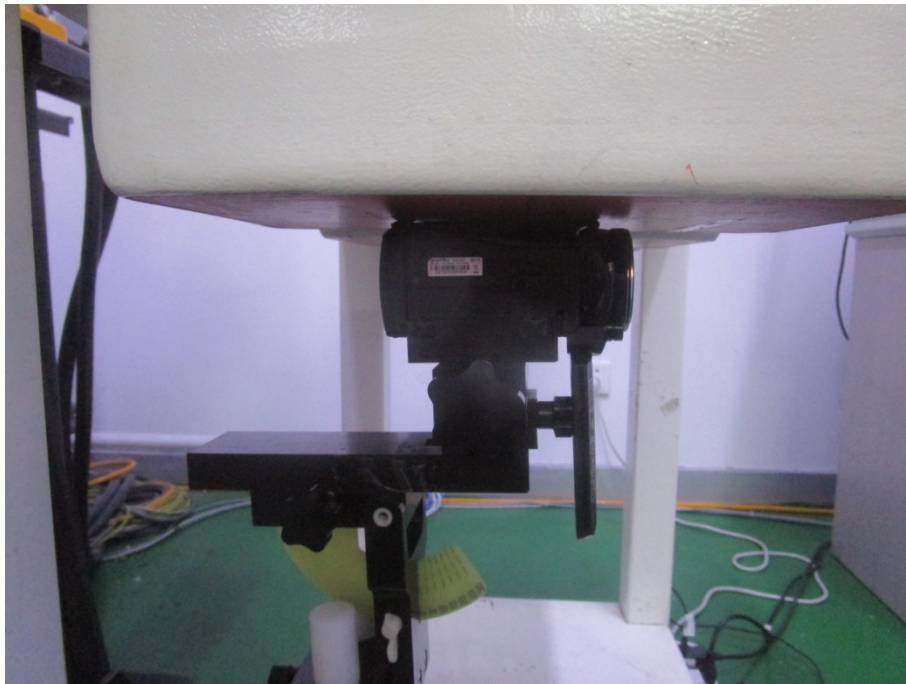
Handheld Bottom Setup Photo (0mm)