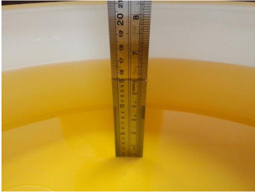
Photo 1: Tissue Simulant Liquid for Head 2300-2500