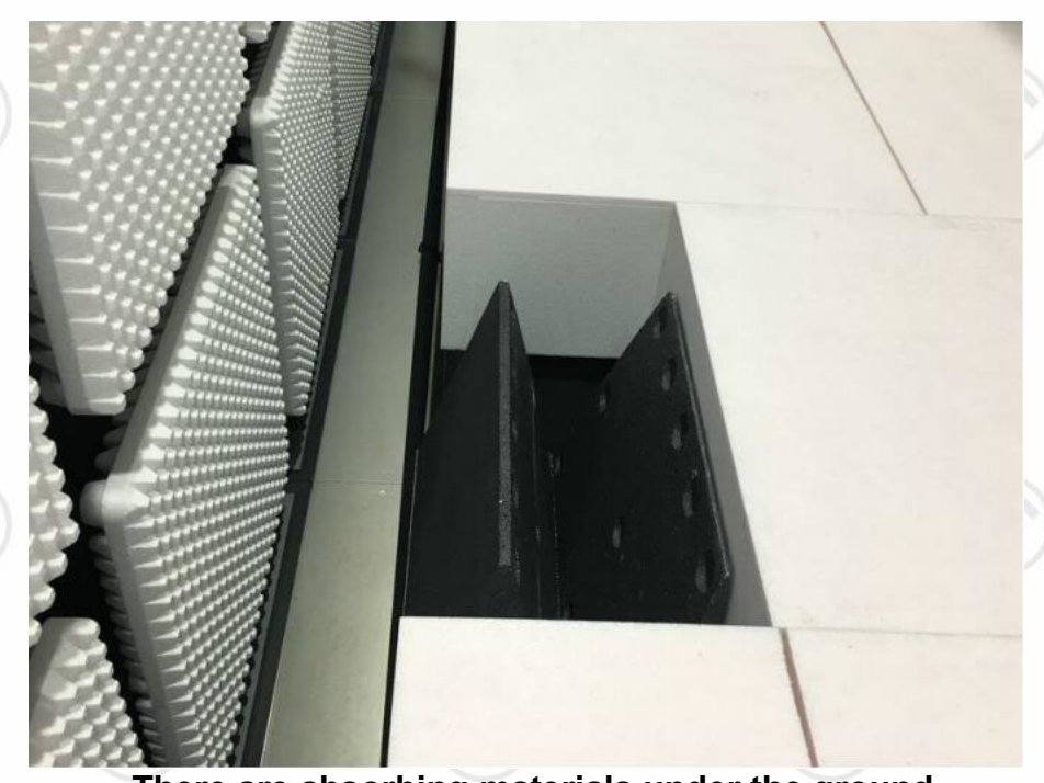
There are absorbing materials under the ground