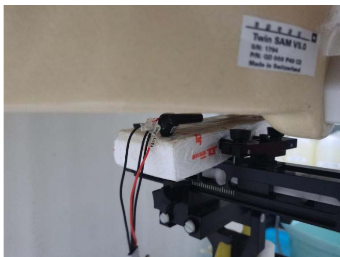
Fig-4.2 Left Side of EUT with 0 cm Gap (Head Mode)