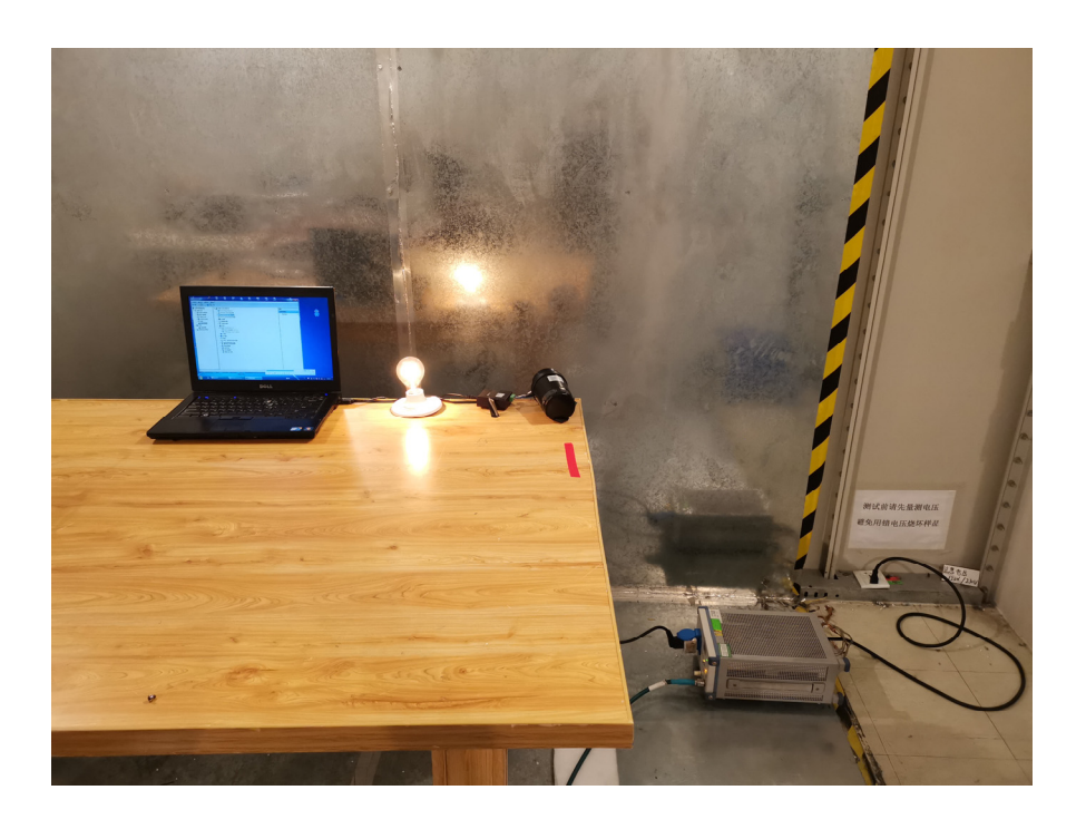
Conducted Emissions - Rear Side