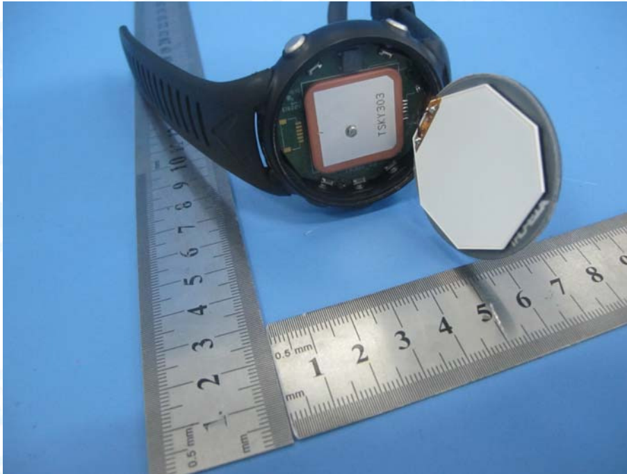
Photo 9 Internal of EUT