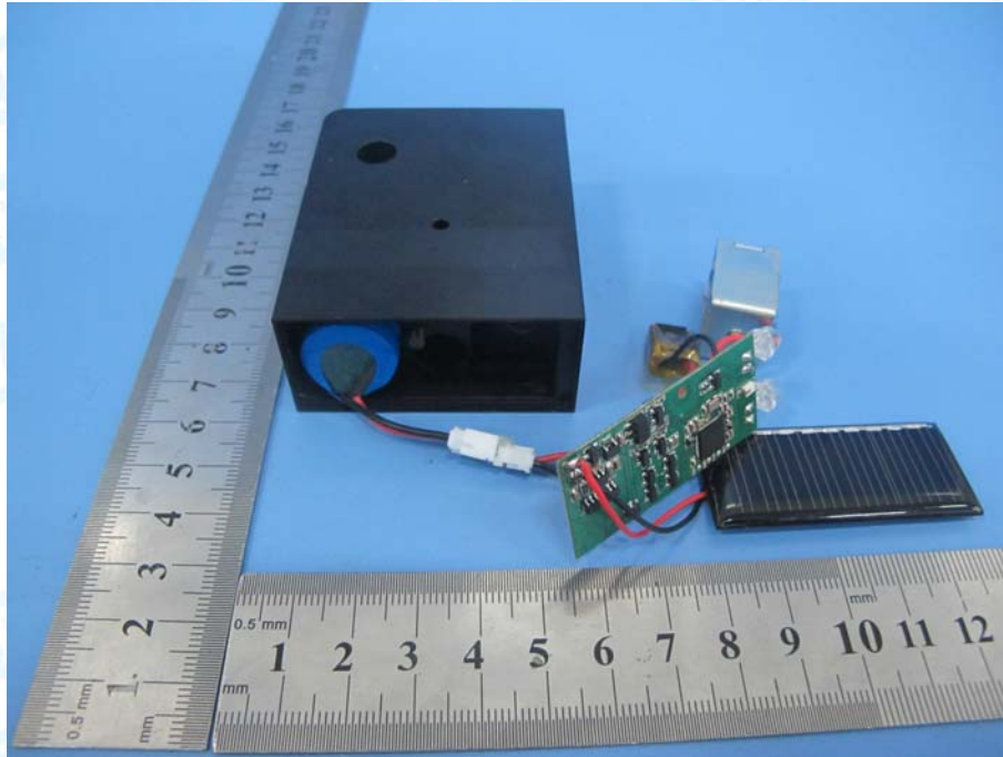
Photo 8 Internal of EUT