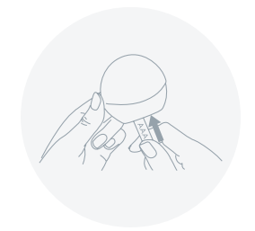
3. Insert the new battery, ensuring the + and – ends are aligned to the markings inside the battery compartment.