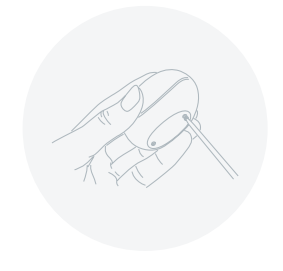
4. Screw the battery cover back into place.