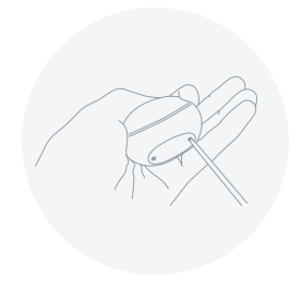
1. Unscrew the battery cover on the product's base.