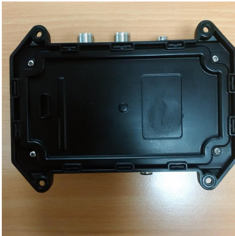
Fig 2: MDA-5 Base