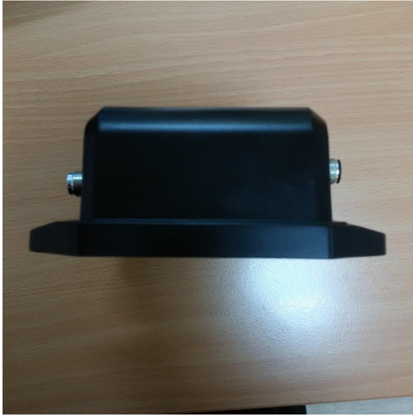
Fig 5: MDA-5 Side