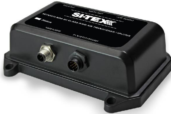
Fig 1: MDA-5 Top