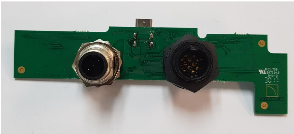
Fig 8: Iris Connector Board front