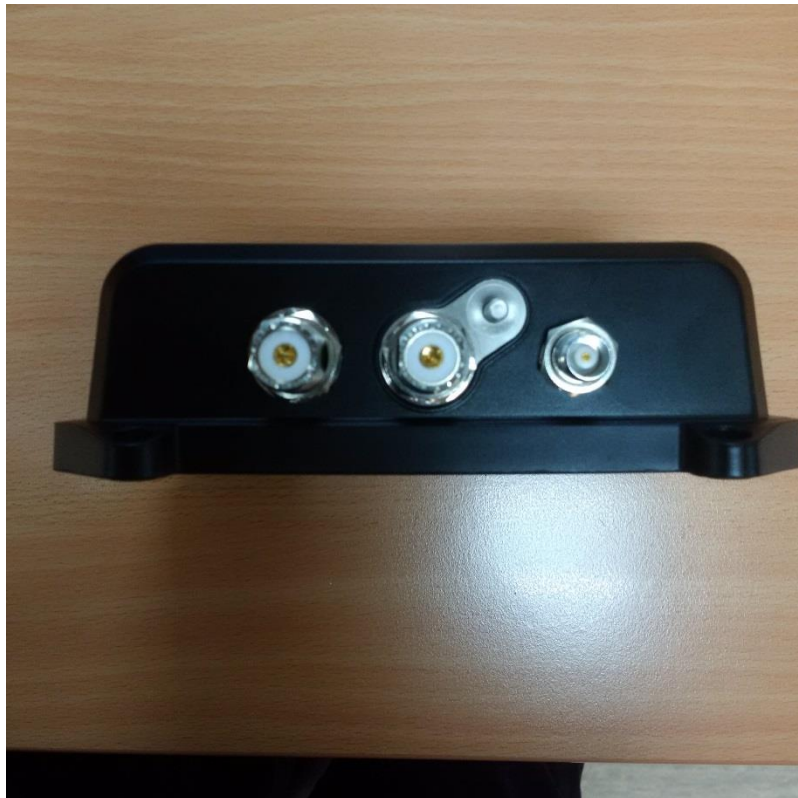
Fig 4: MDA-5 Rear