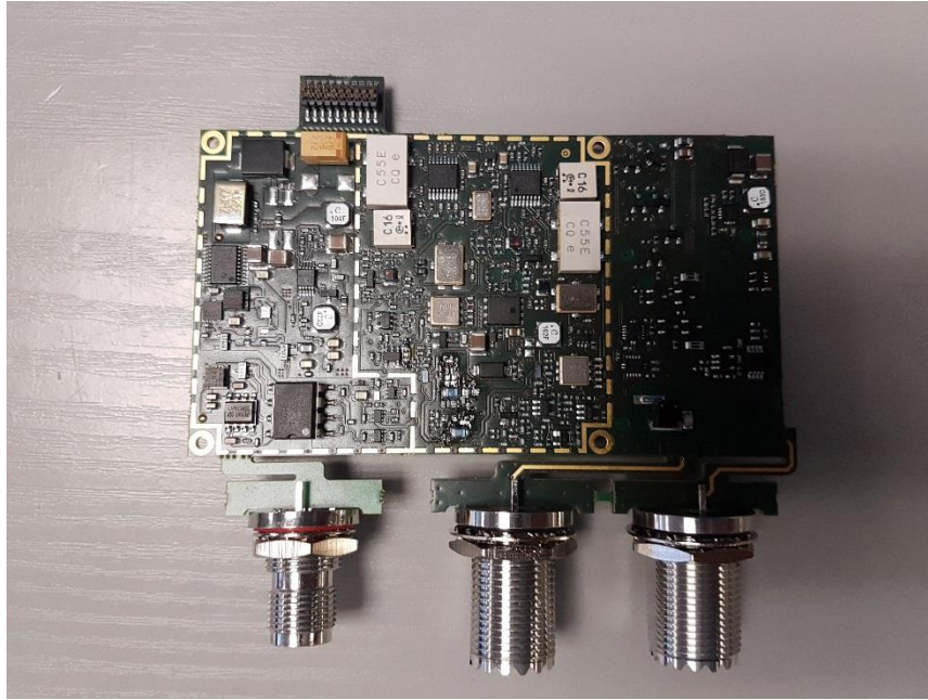
Fig 7: Iris PCA Bottom