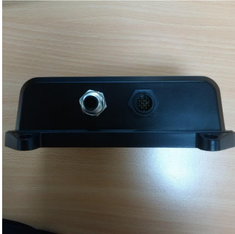
Fig 3: MDA-5 Front