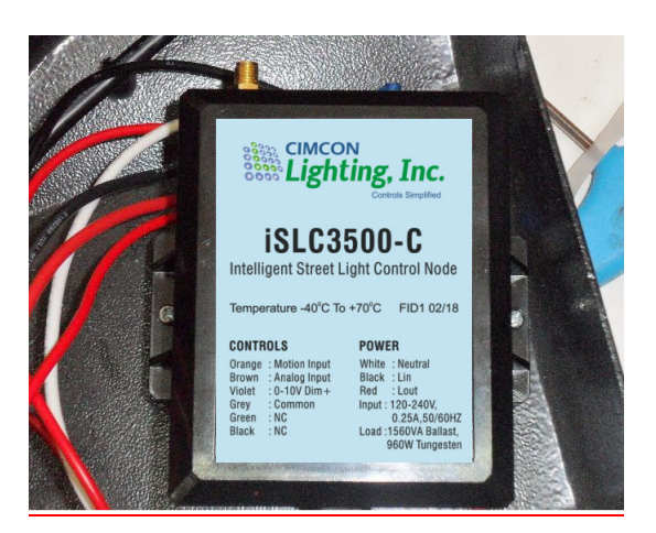
[Image-2: Screw fixed with over mounting stud inside fixture, example image only]