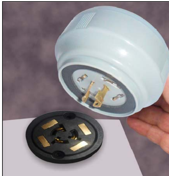
Fig. 1 Installation of iSLC3100-7P-C on the luminaire

Place the Photocontroller into the 7-pin NEMA receptacle and rotate it clockwise to lock.