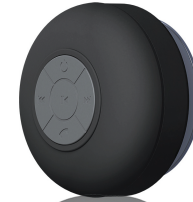
Wireless Shower Speaker