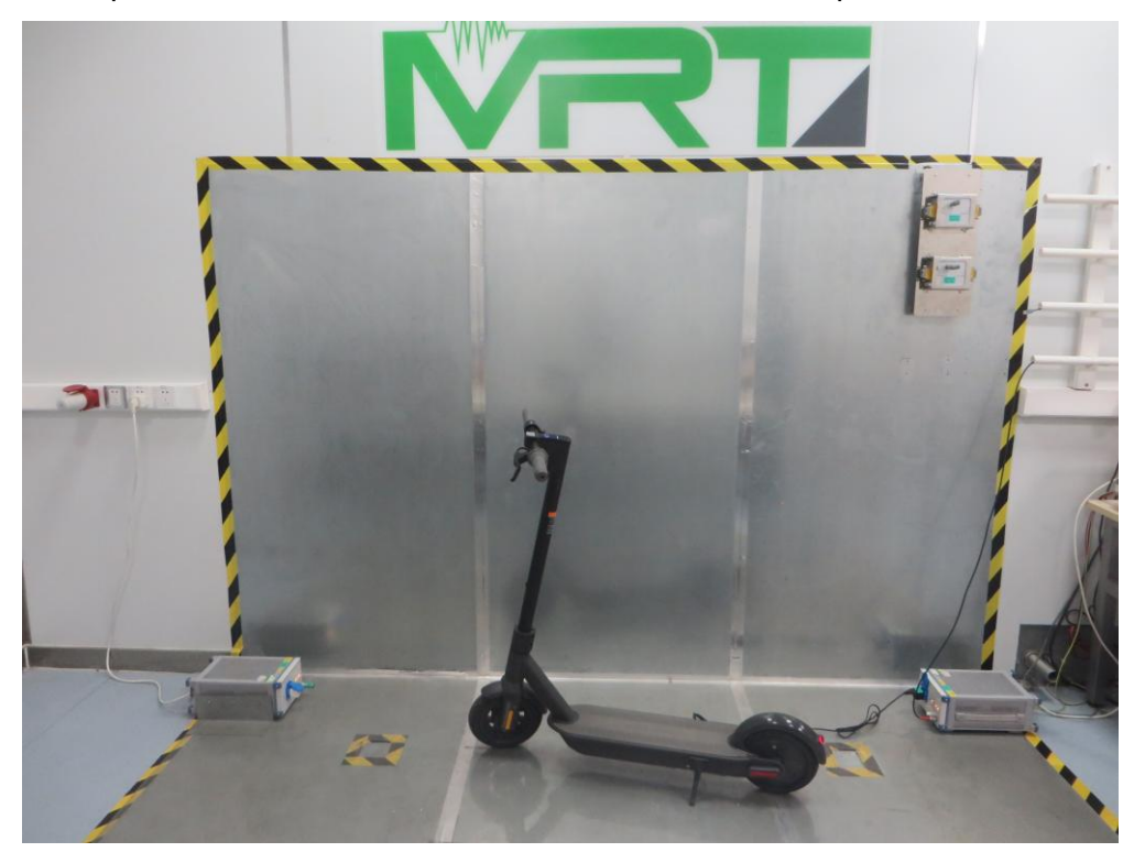
Description: Radiated Spurious Emission Test Setup for 30MHz ~ 1GHz

Description: Front View of Conducted Emission Test Setup for Power Port