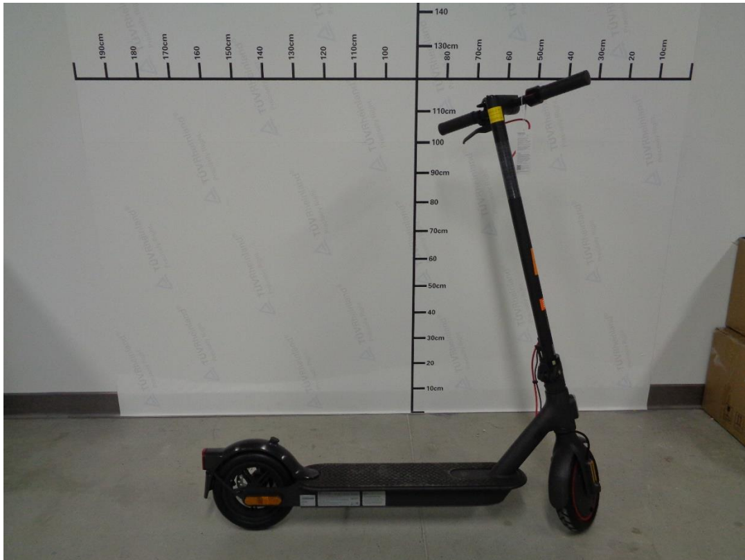
Pic. 3: Overview of DDHBC15NEB