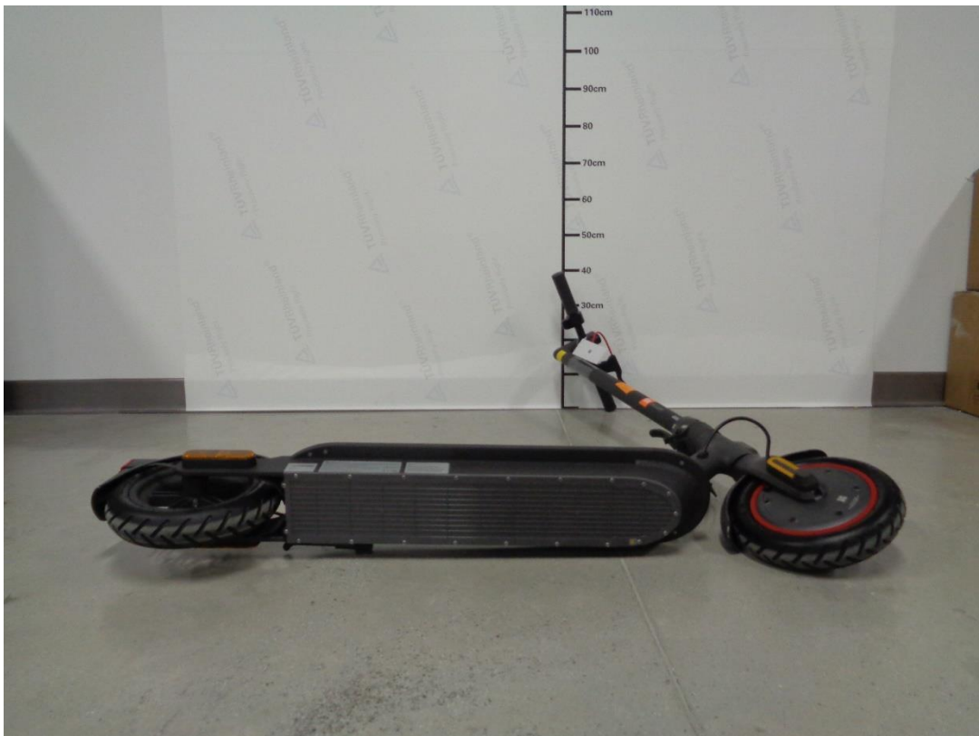
Pic. 6: Overview of DDHBC15NEB