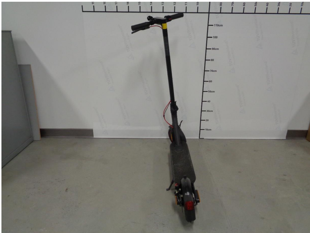
Pic. 4: Overview of DDHBC15NEB