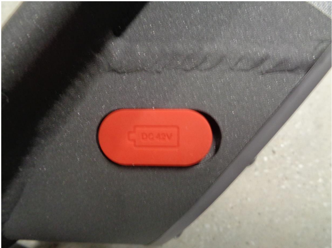
Pic. 6: charging port