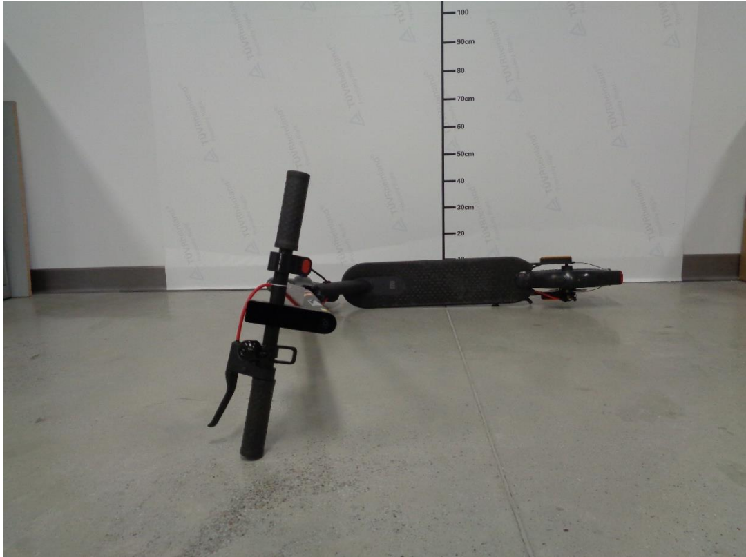
Pic. 5: Overview of DDHBC15NEB