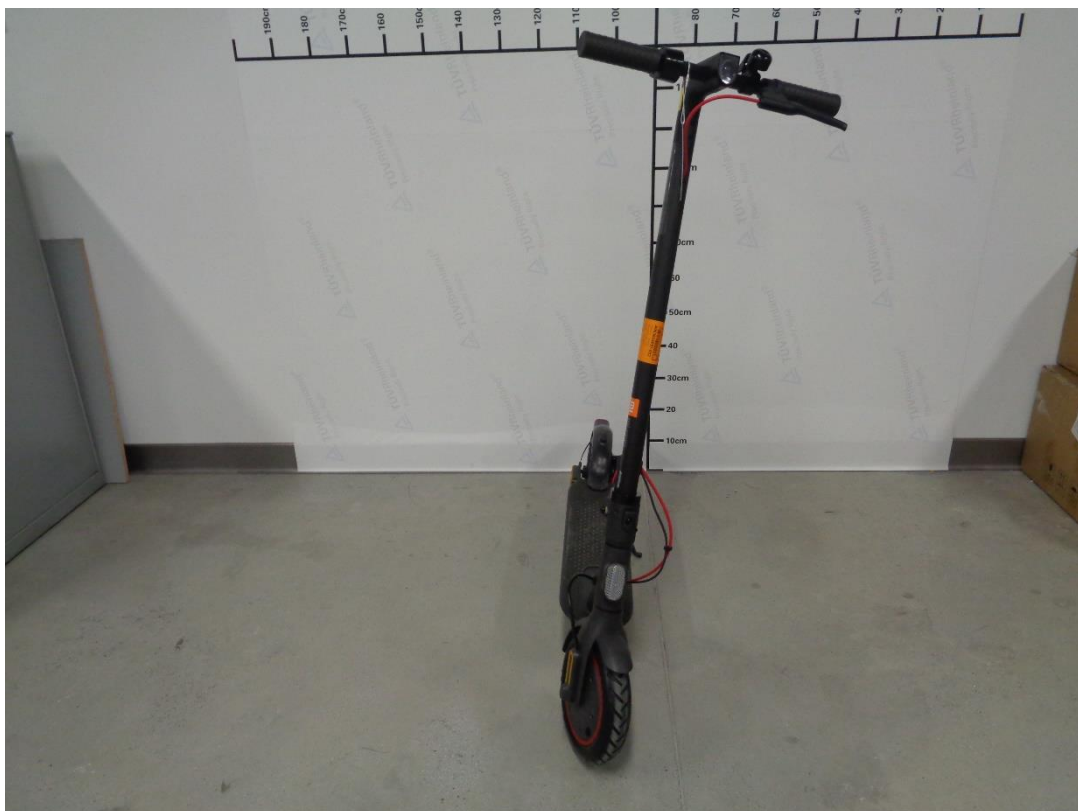
Pic. 2: Overview of DDHBC15NEB