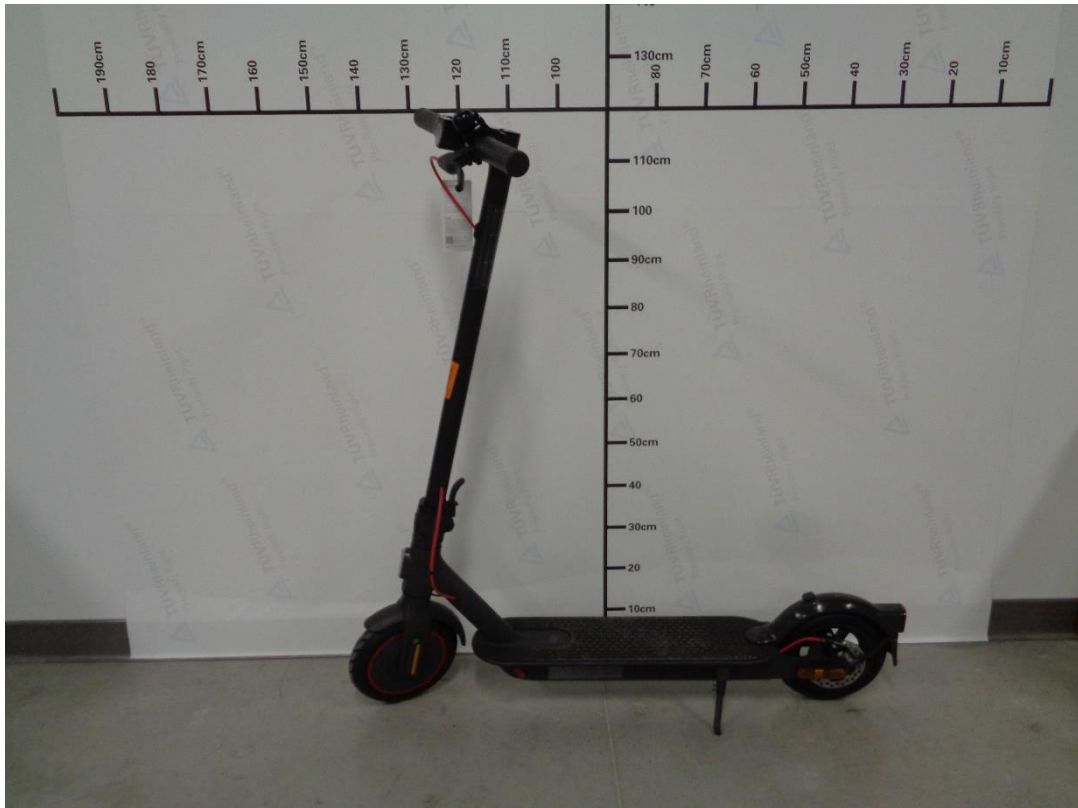
Pic. 1: Overview of DDHBC15NEB