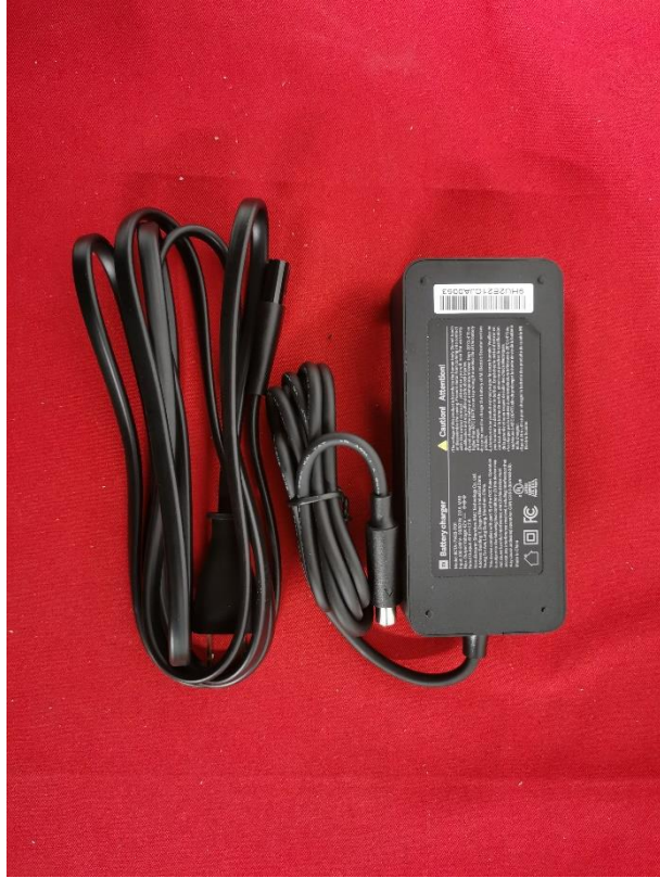
Pic. 7: overview of adapter