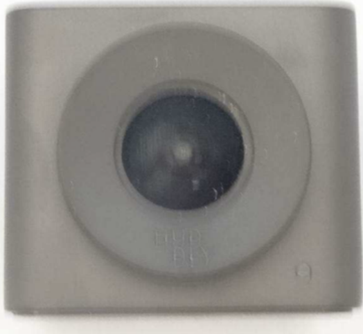
Front side with camera lens and indicator light (bottom right)