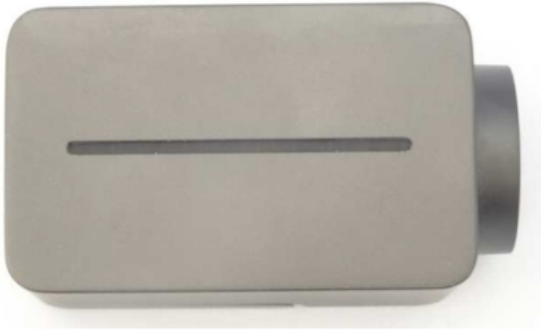
EUT, top side