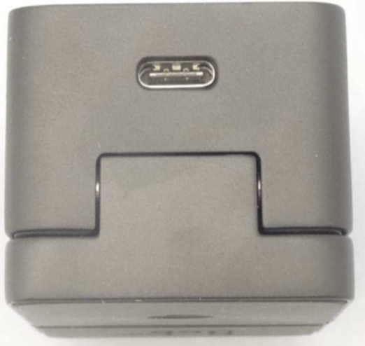
Rear side with USB Type-C connector J2