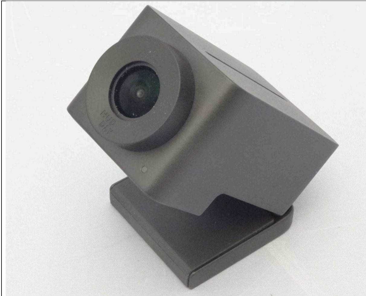
EUT standing on angled metal foot

Photos in this attachment may show outdated versions of markings on the EUT. See the section “copy of marking plate” in IEC 60950-1 test report for the latest version of safety relevant markings.