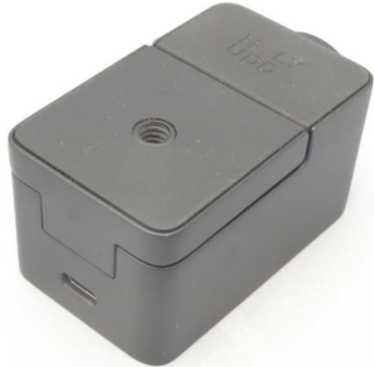
EUT, showing rear side with USB type-C connector J2 and bottom side with metal foot (metal foot can be angled, e.g. to clip the camera to a laptop screen)