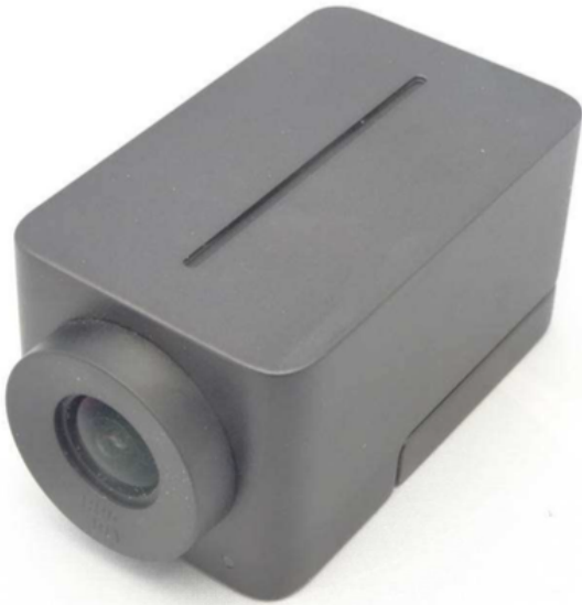
EUT, showing front side with camera lens and top side with slot for microphone