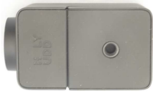
EUT, bottom side