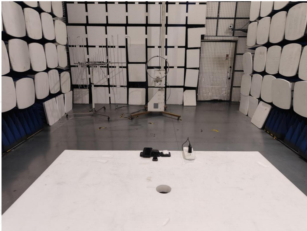
Radiated Emission below 30MHz-AC adapter charge mode