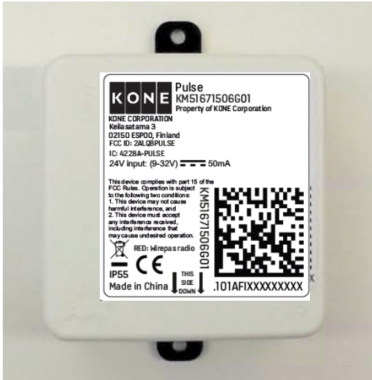
Example of location of the label on the product

Label material: Name: Pressure Sensitive Adhesive Materials MPN: BW9319 Manufacturer: Averydennison