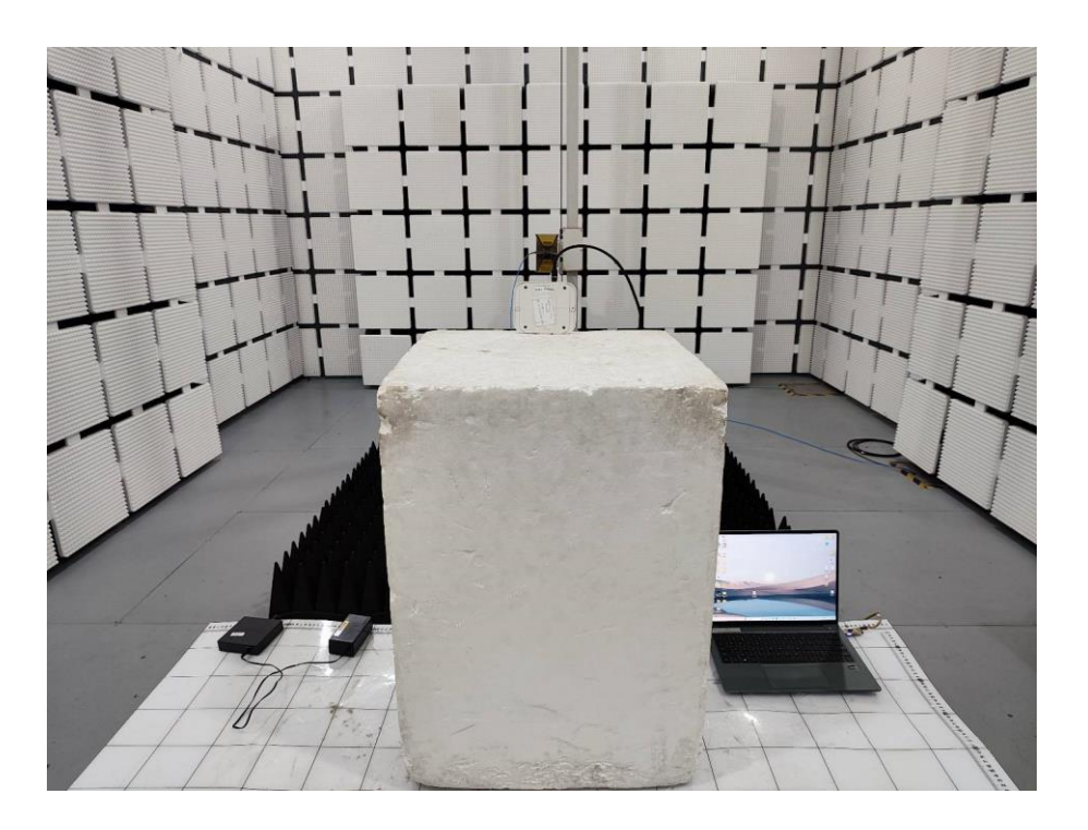
Set-up for Radiated Spurious Emission, Above 1GHz

Set-up for Radiated Spurious Emission, Below 1GHz