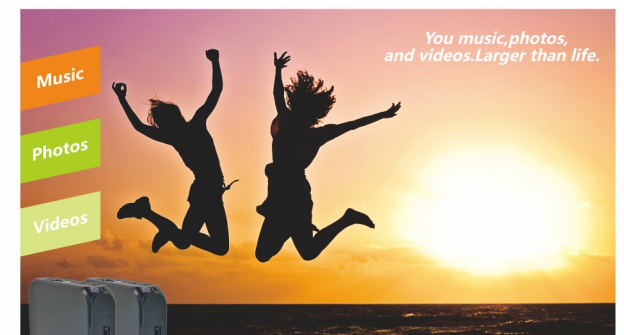
Android TV BOX Allowing users to enjoy the full range of information on television,data,language and other services.