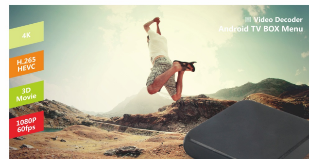
Video Decoder Video picture Decoding: Avi/Rm/Rmvp/Ts/Vob/Mkv/Mov/ISO/wmv/asf/flv/dat/mpg/mpeg HD JPEG/BMP/GIF/PNG/TIFF