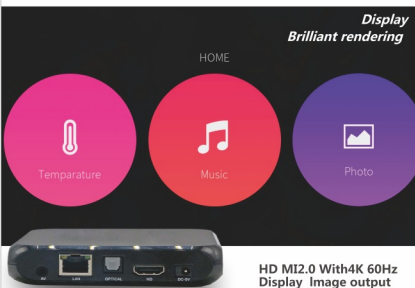
HD MI2.0 With4K 60Hz Display Image output