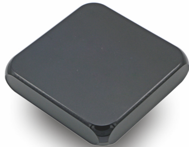
Android TV BOX Production

Amlogic S905X Quad-core 2GB DDR3+16G EMMC Android 6.0