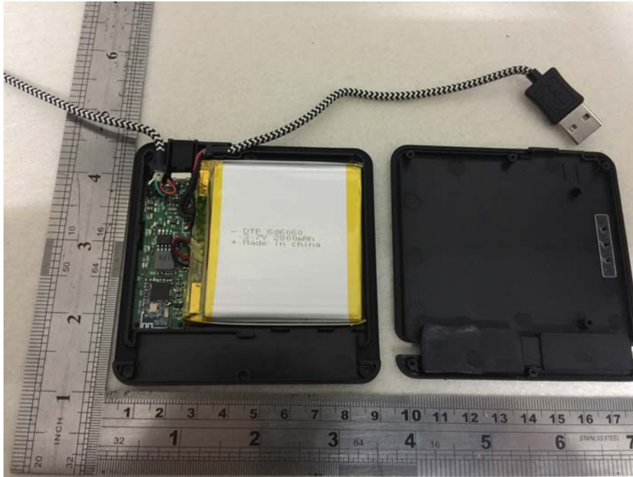
Photo 6 Appearance of PCB