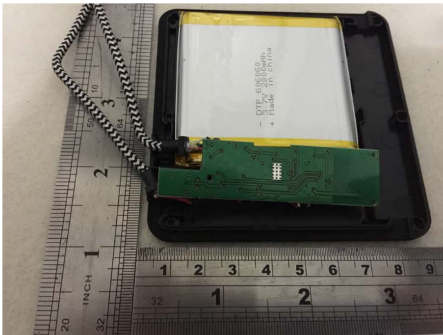
Photo 8 Appearance of PCB