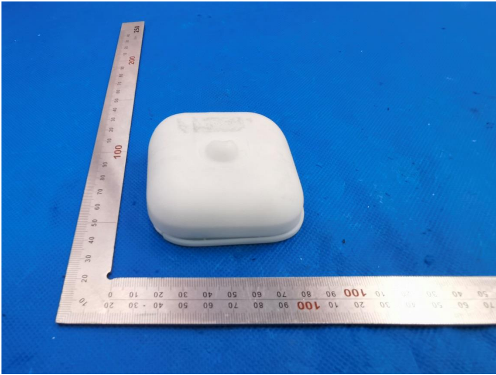
EXTERNAL VIEW-4 OF EUT