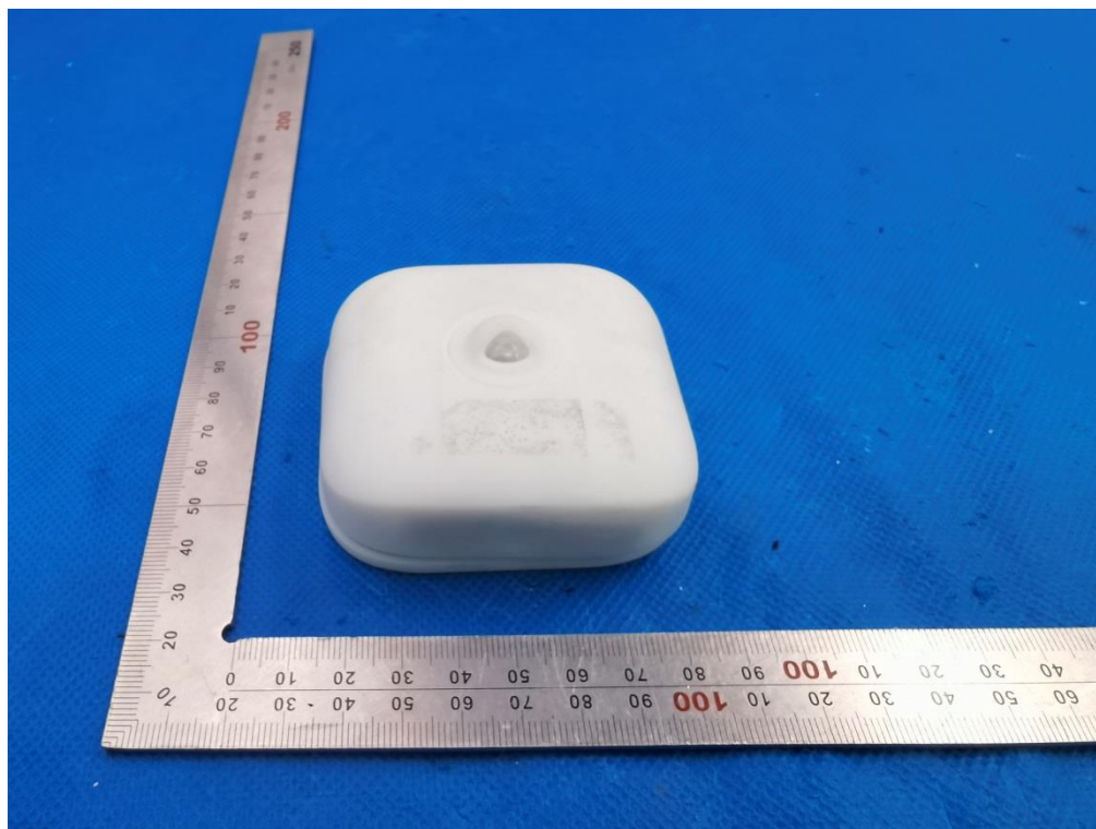
EXTERNAL VIEW-6 OF EUT