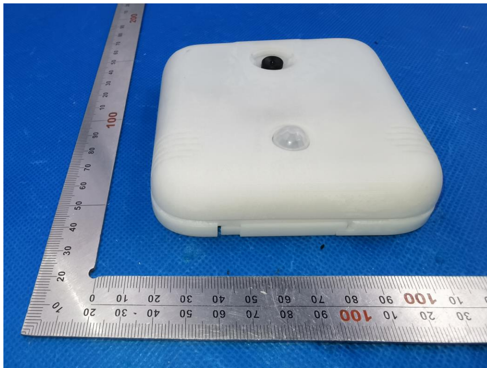
EXTERNAL VIEW-4 OF EUT