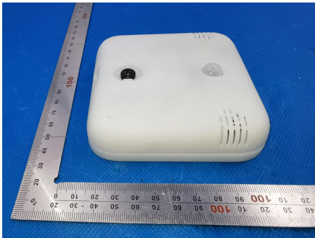
EXTERNAL VIEW-6 OF EUT