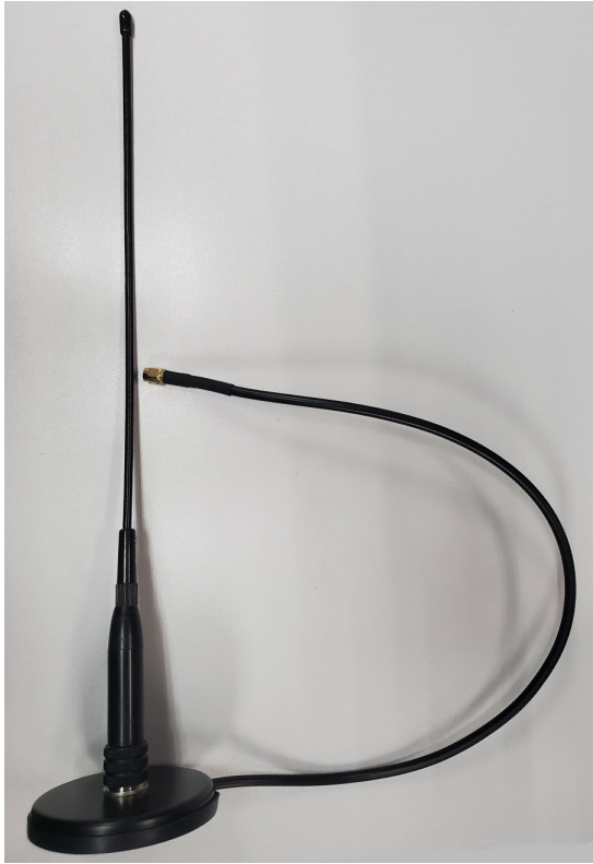
External Antenna1 (Optional)