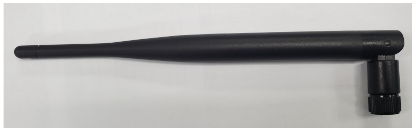
External Antenna3 (Optional)