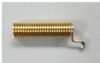
Internal Antenna (Optional)