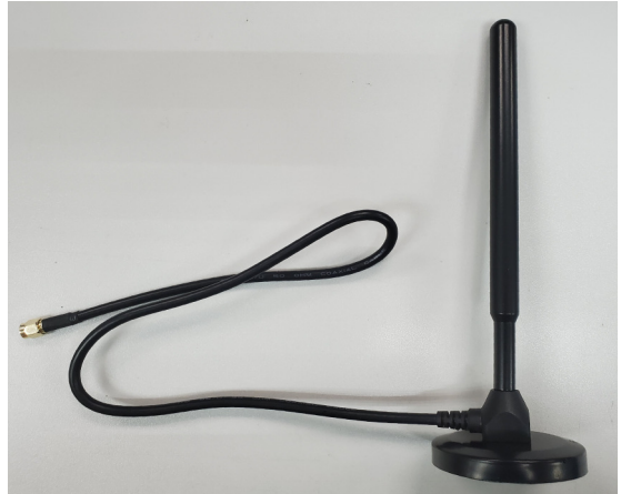
External Antenna2 (Optional)