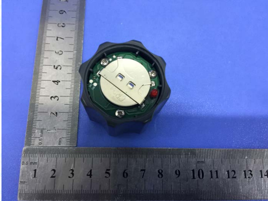
Photo 10 Appearance of PCB