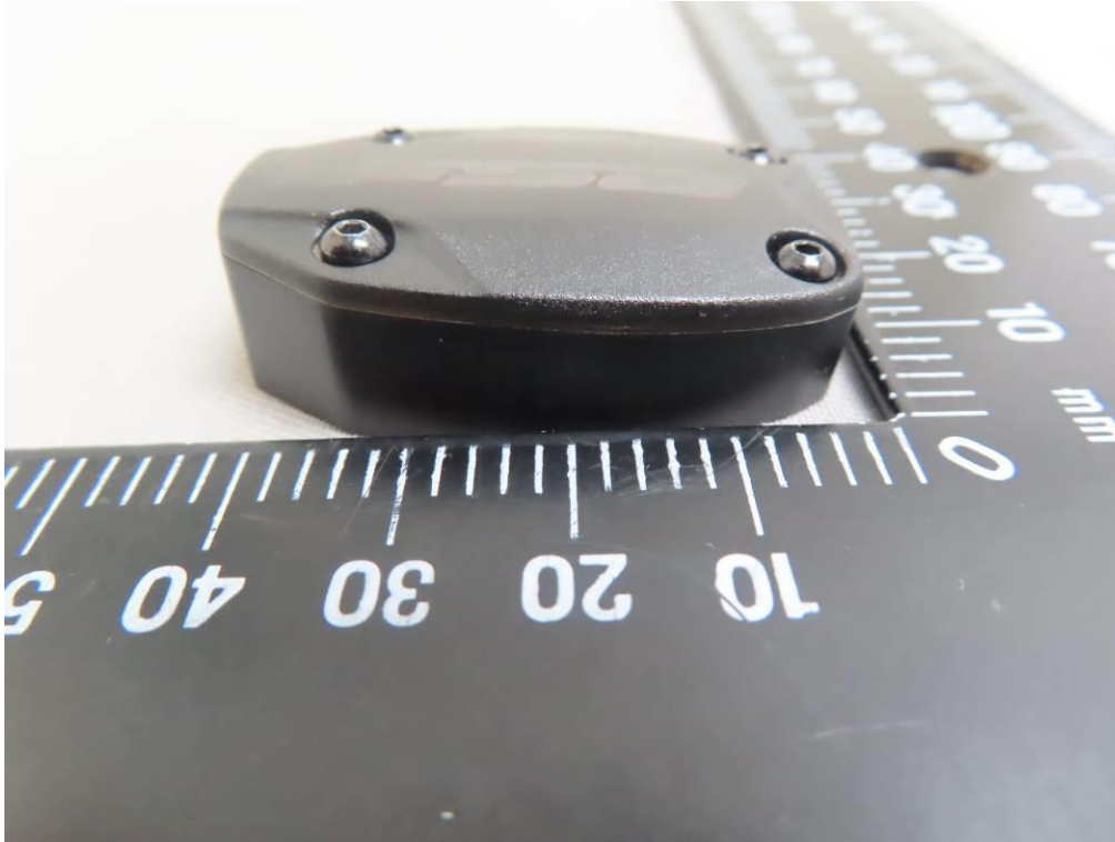
Side View of EUT – 6