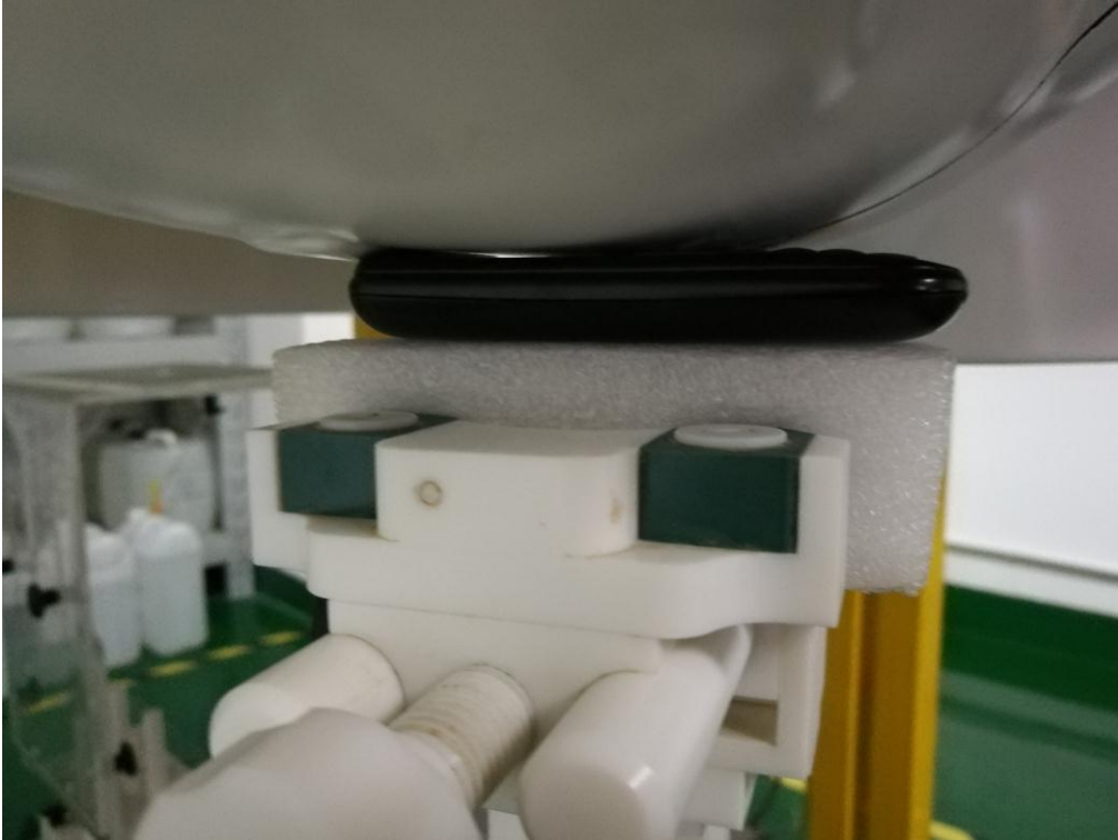
Right Head Tilt View