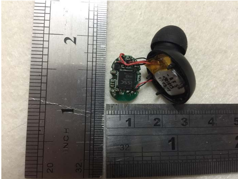
Photo 10 Appearance of PCB