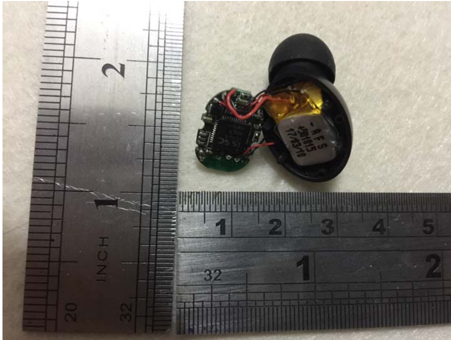
Photo 9 Appearance of PCB