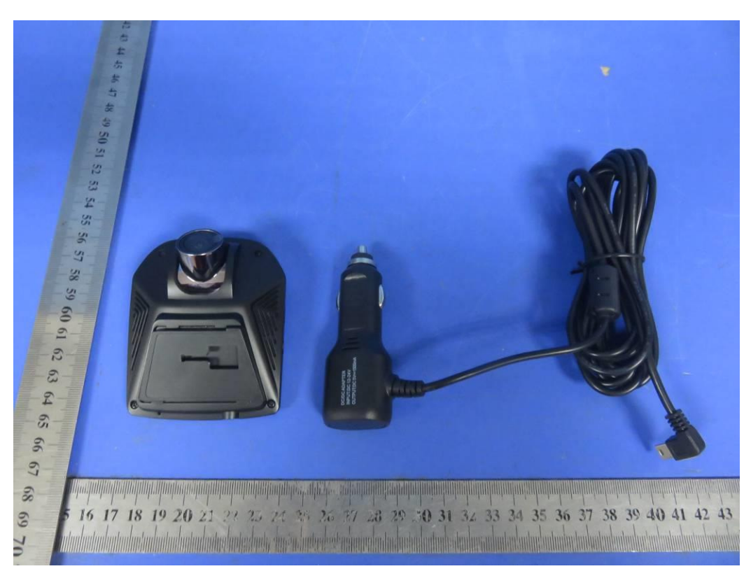
Fig.8 Model No: A305