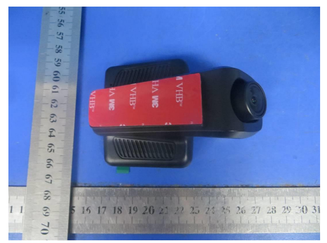
Fig.3 Model No: A307_Back