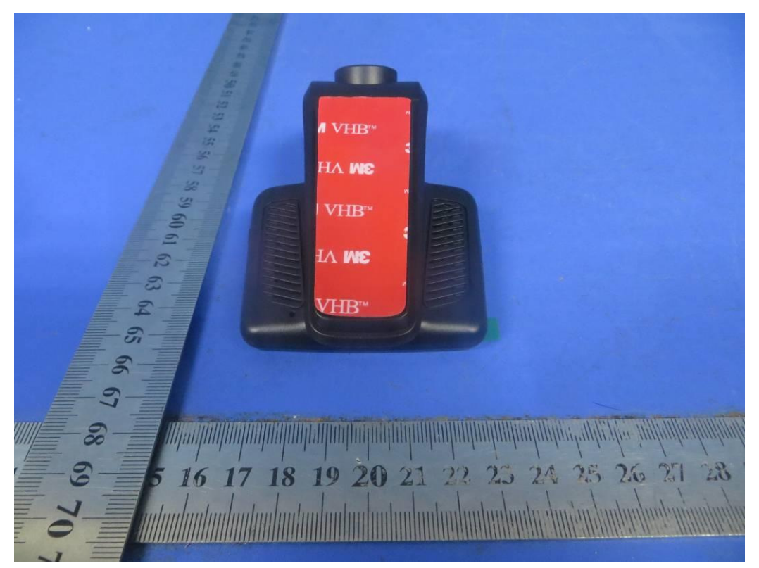
Fig.5 Model No: A307_Bottom