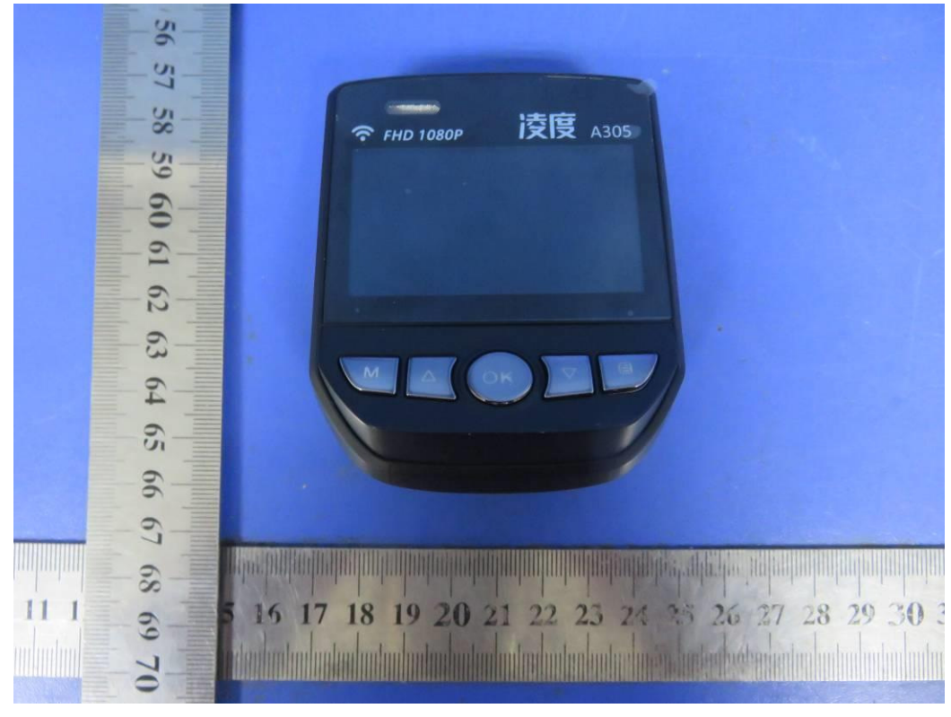
Fig.9 Model No: A305_Front

This report shall not be reproduced except in full, without the written approval of Shenzhen LCS Compliance Testing Laboratory Ltd.. Page 5 of 8