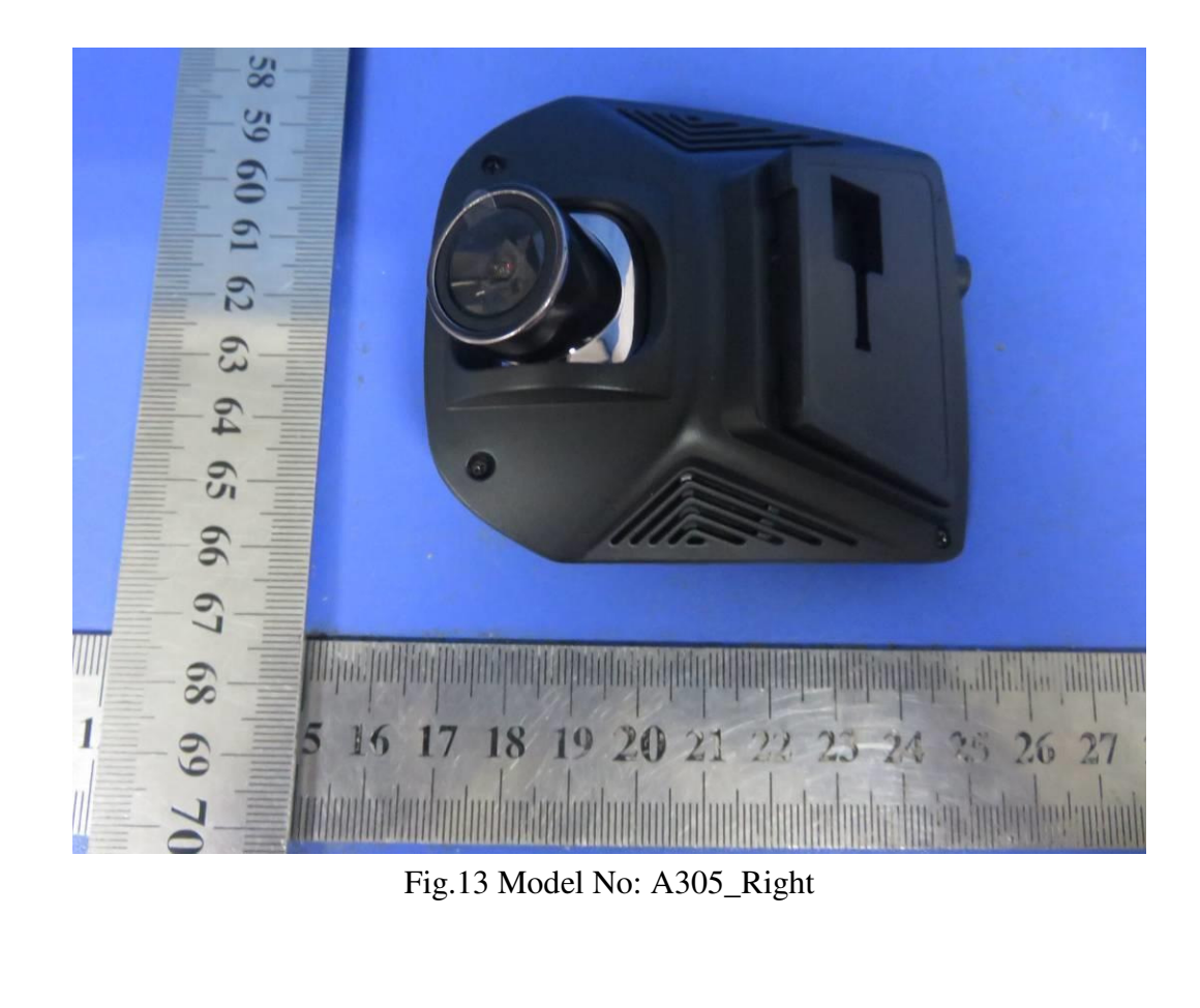
Fig.12 Model No: A305_Bottom

This report shall not be reproduced except in full, without the written approval of Shenzhen LCS Compliance Testing Laboratory Ltd.. Page 7 of 8