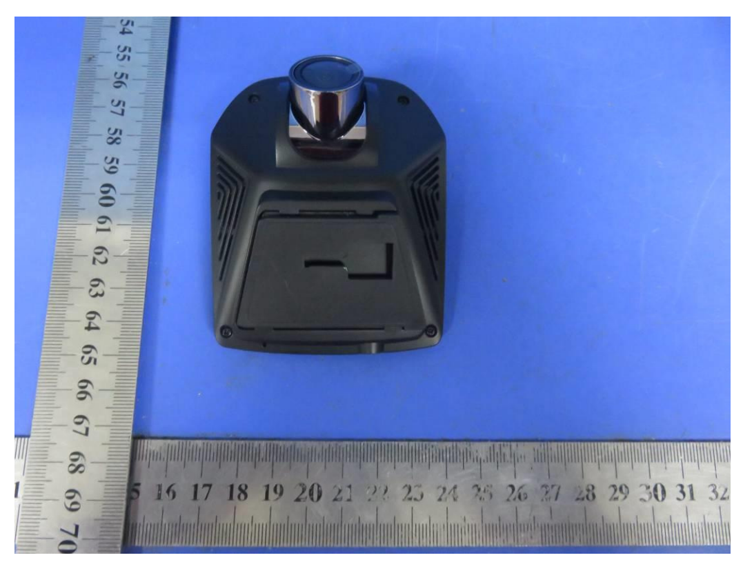
Fig.14 Model No: A305_Back

This report shall not be reproduced except in full, without the written approval of Shenzhen LCS Compliance Testing Laboratory Ltd.. Page 8 of 8