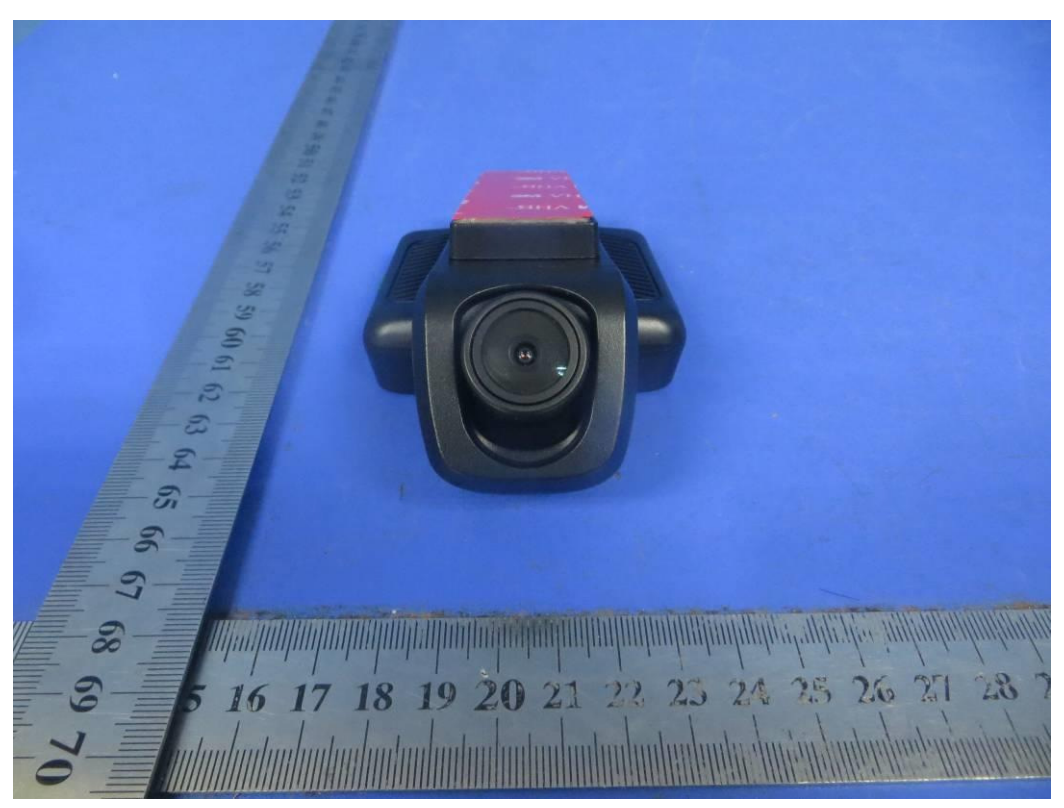
Fig.7 Model No: A307_Top

This report shall not be reproduced except in full, without the written approval of Shenzhen LCS Compliance Testing Laboratory Ltd.. Page 4 of 8