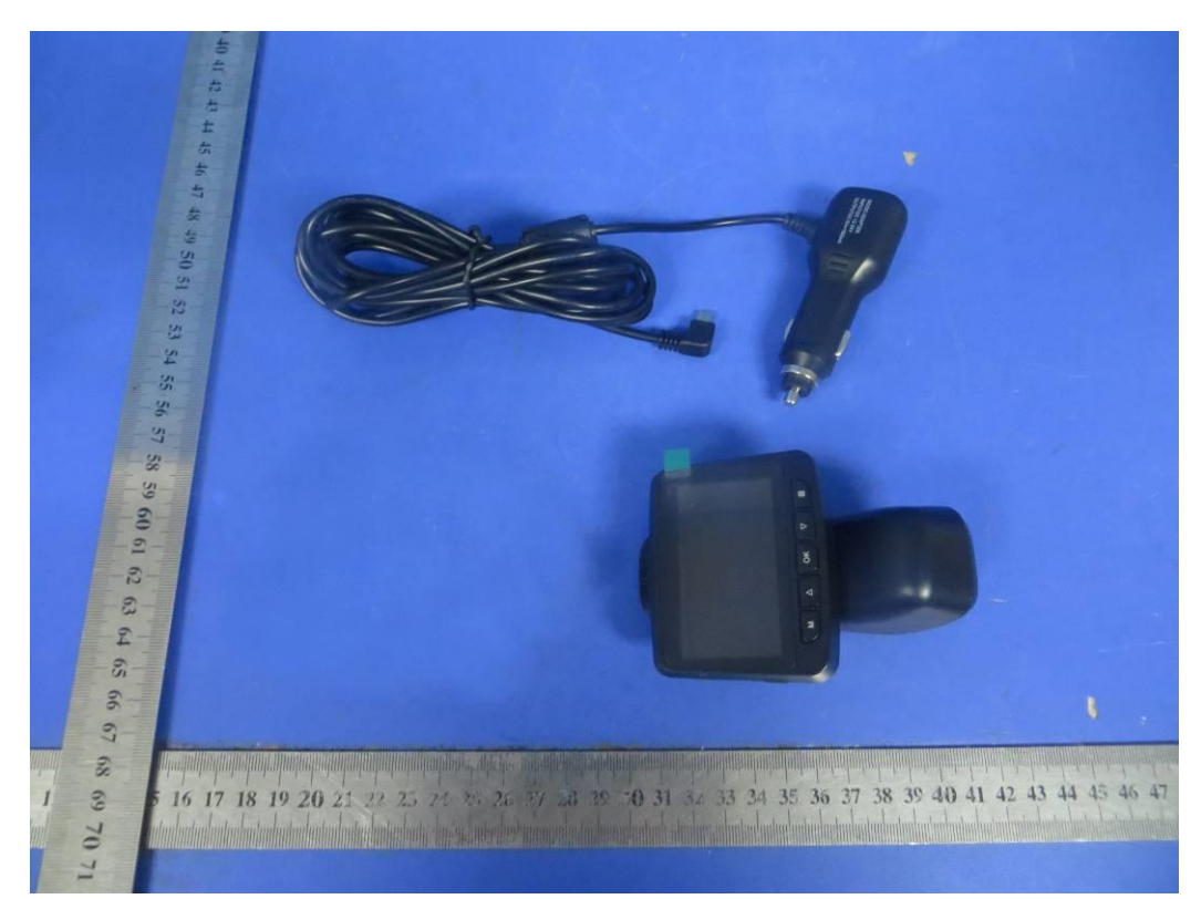
Fig.1 Model No: A307