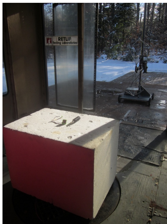
Vertical Antenna Polarization, 30 MHz to 200 MHz, Biconical Antenna