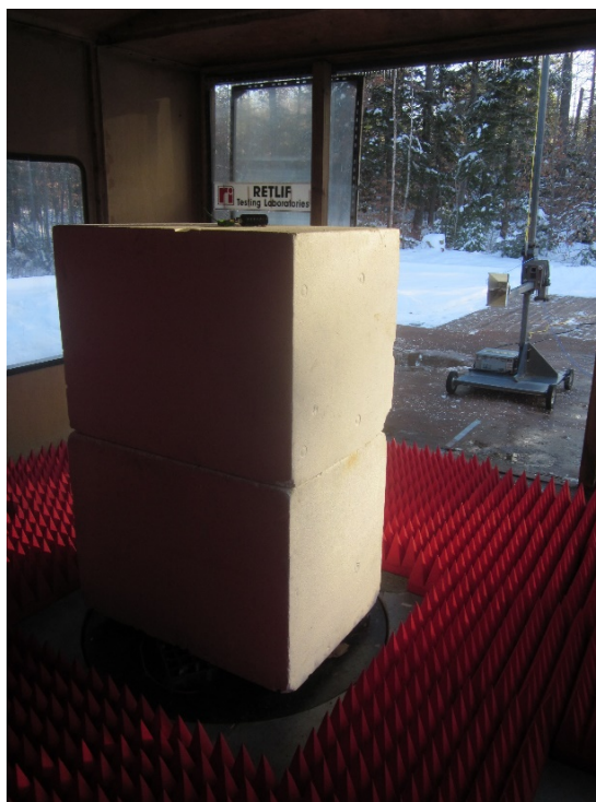
Horizontal Antenna Polarization, 1 GHz to 18 GHz, Double Ridged Guide