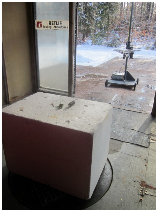
Horizontal Antenna Polarization, 200 MHz to 1 GHz, Log Periodic