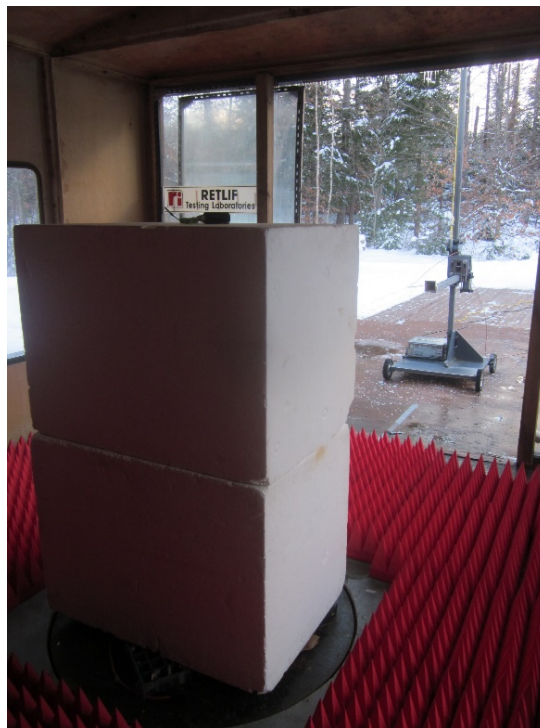
Horizontal Antenna Polarization, 18 GHz to 25 GHz, Horn