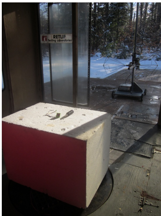
Horizontal Antenna Polarization, 30 MHz to 200 MHz, Biconical Antenna