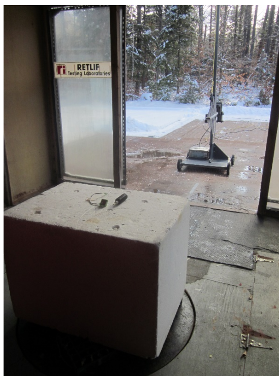
Vertical Antenna Polarization, 200 MHz to 1 GHz, Log Periodic