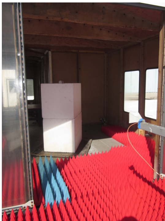
Horizontal Antenna Polarization, 18 GHz to 25 GHz, High Gain Horn Antenna