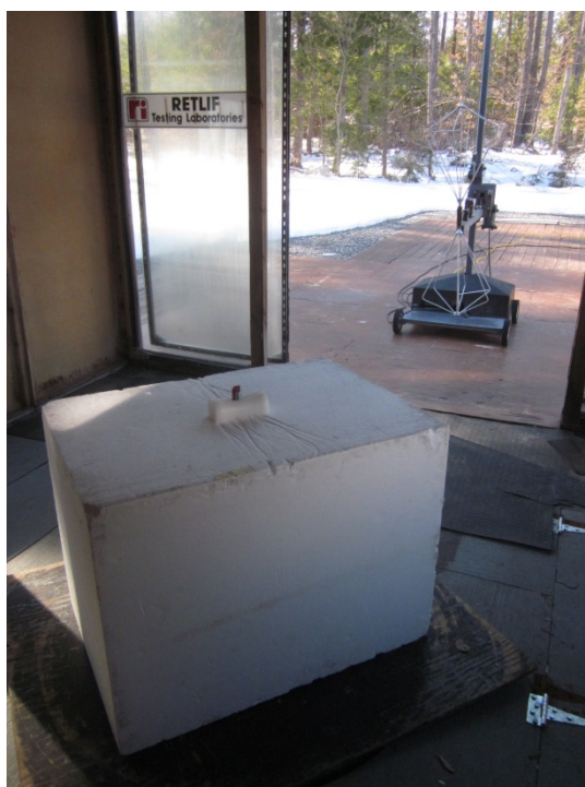
Vertical Antenna Polarization, 30 MHz to 200 MHz, Biconical Antenna