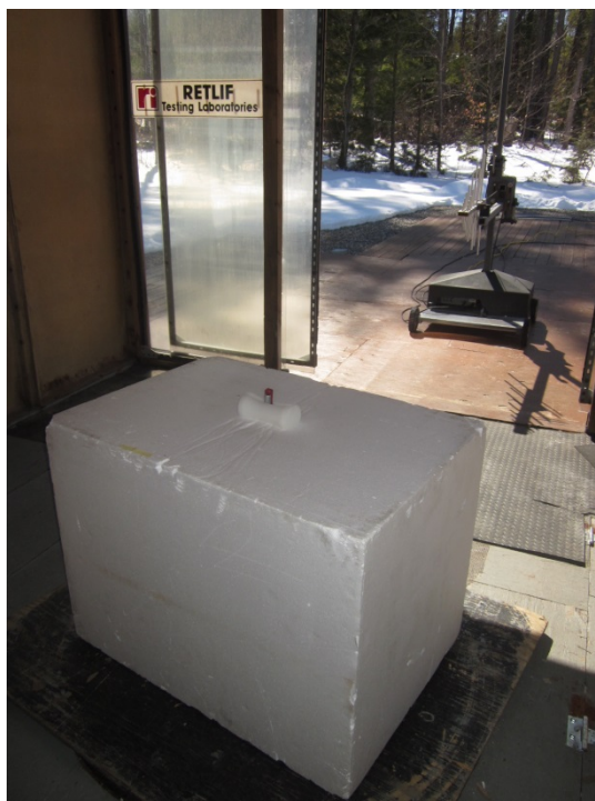
Vertical Antenna Polarization, 200 MHz to 1 GHz, Log Periodic Antenna