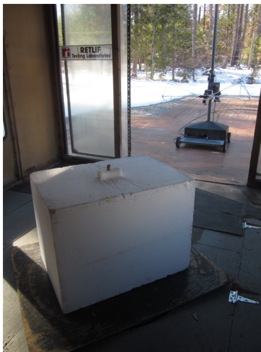
Horizontal Antenna Polarization, 30 MHz to 200 MHz, Biconical Antenna