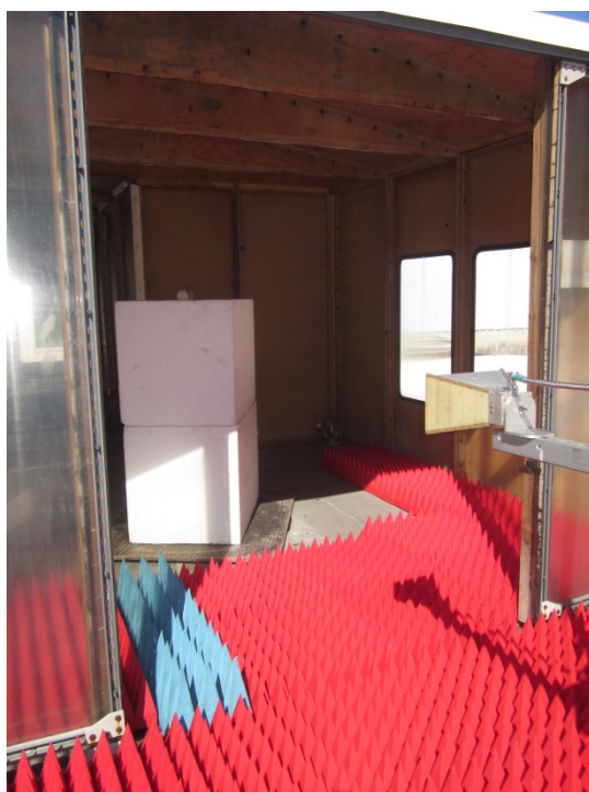
Vertical Antenna Polarization, 1 GHz to 12 GHz, Double Ridge Guide Antenna