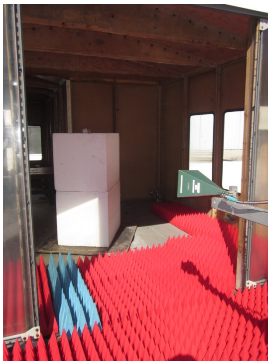
Horizontal Antenna Polarization, 12 GHz to 18 GHz, High Gain Horn Antenna