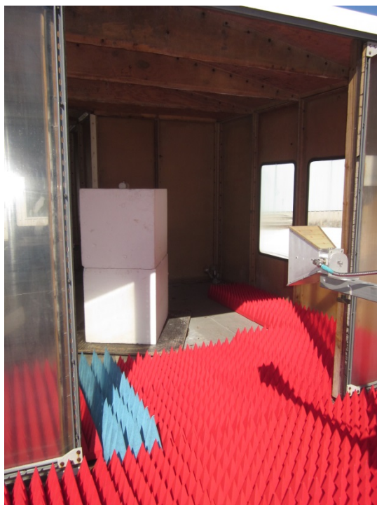
Horizontal Antenna Polarization, 1 GHz to 12 GHz, Double Ridge Guide Antenna