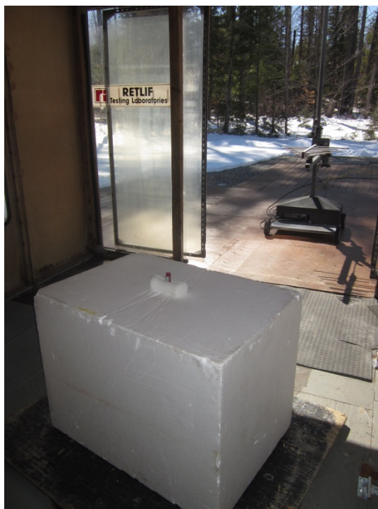
Horizontal Antenna Polarization, 200 MHz to 1 GHz, Log Periodic Antenna