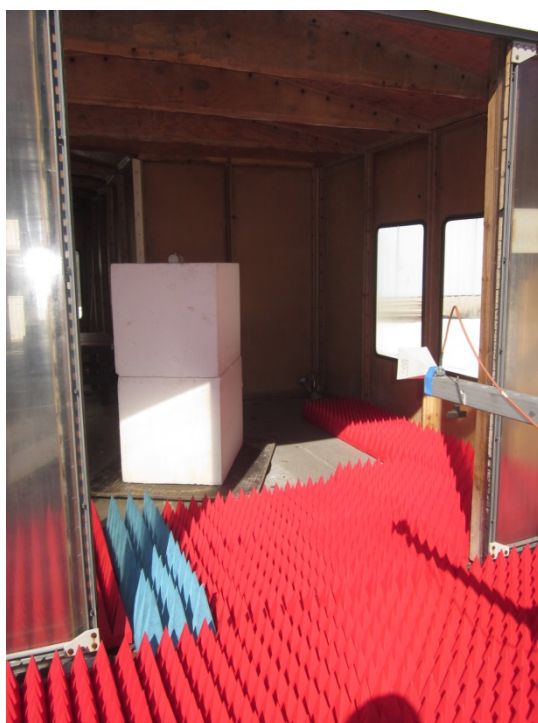
Vertical Antenna Polarization, 18 GHz to 25 GHz, High Gain Horn Antenna