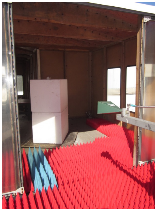
Vertical Antenna Polarization, 12 GHz to 18 GHz, High Gain Horn Antenna