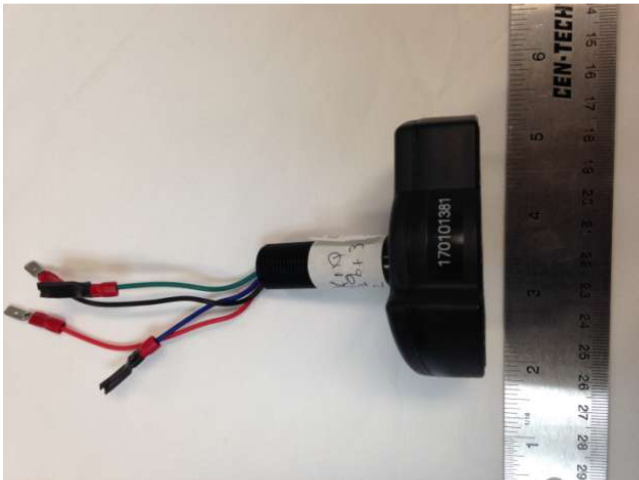
Figure 1. Top View