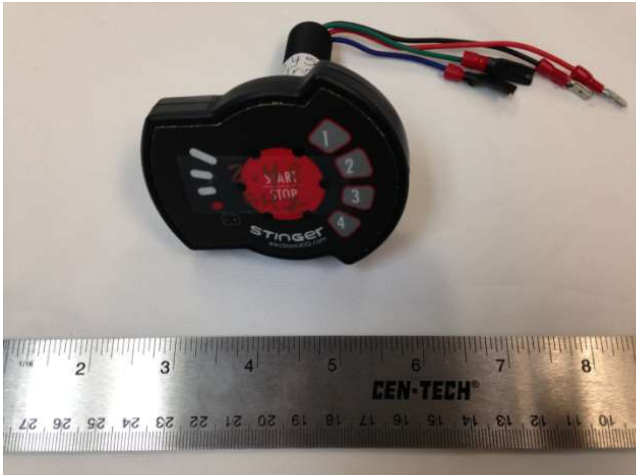
Figure 6. Front of EUT

FCC Part 15.209/249 2ALIF-STR02 19-0453 December 3, 2019 ElectronixIQ STINGER 2