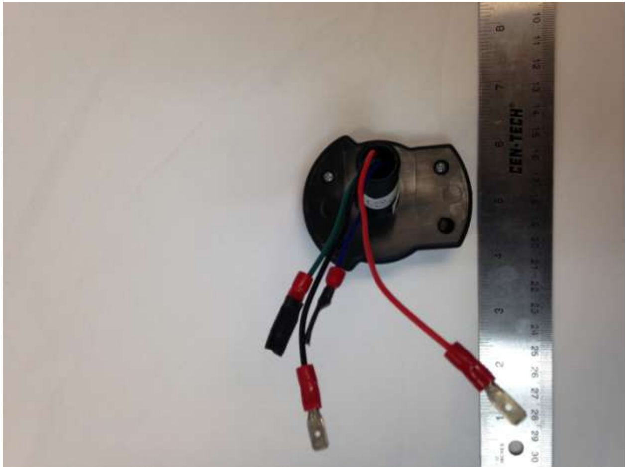
Figure 5. Back of EUT

FCC Part 15.209/249 2ALIF-STR02 19-0453 December 3, 2019 ElectronixIQ STINGER 2