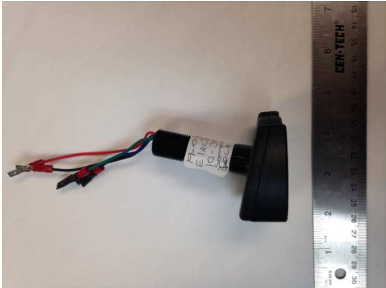
Figure 2. Side 1 View

FCC Part 15.209/249 2ALIF-STR02 19-0453 December 3, 2019 ElectronixIQ STINGER 2