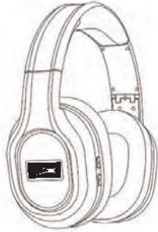
MZX667 EVOLUTION 2 Bluetooth Headphones

For a look at the various buttons and parts of your headphones, view the graphic below.