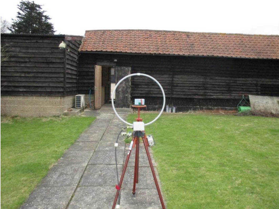
Test Site OATS (3 metre test distance)