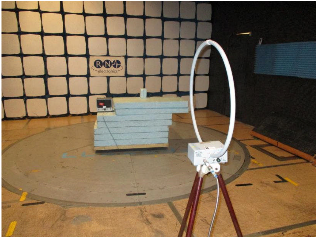
Test Site H