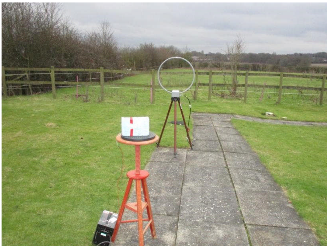
Test site OATS