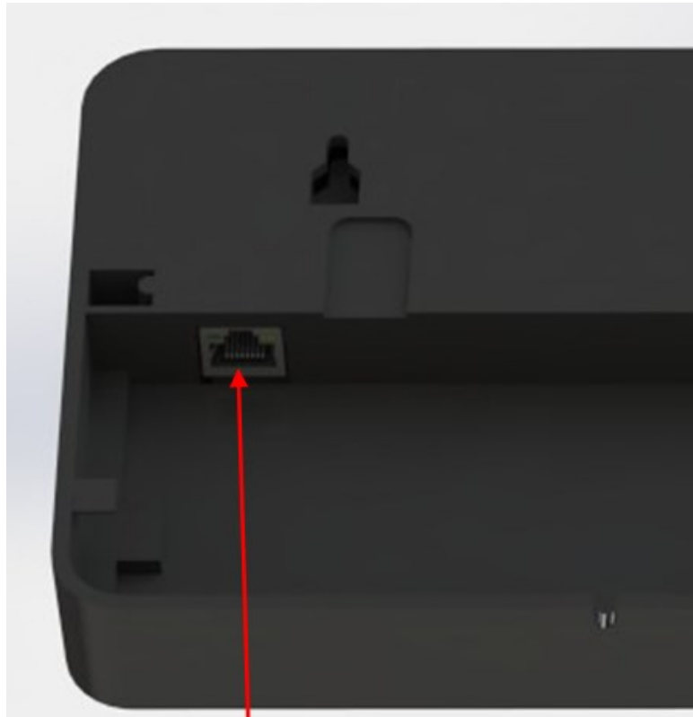
RJ45 connector (LAN/PoE)