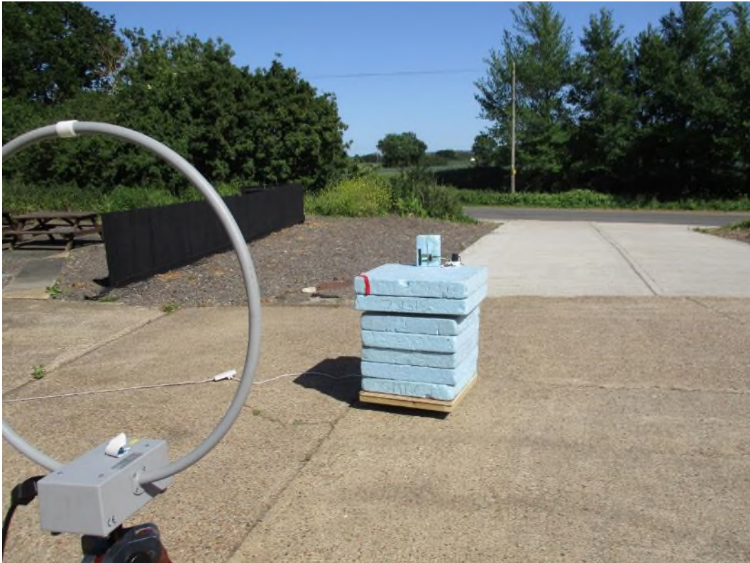
1.2 Radiated emissions 30 MHz – 1 GHz