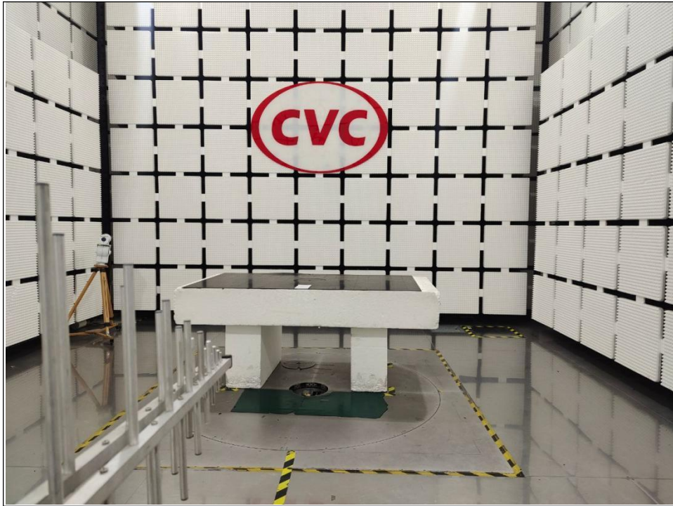
RADIATED EMISSION TEST BELOW 1GHz