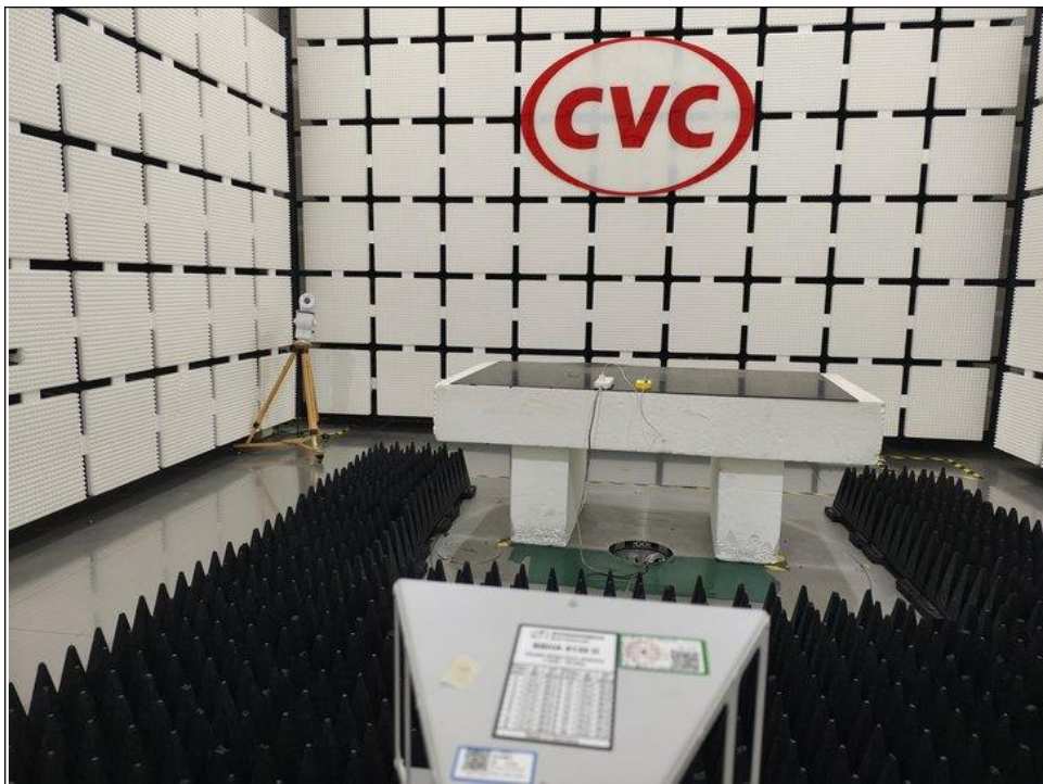
RADIATED EMISSION TEST ABOVE 1GHz