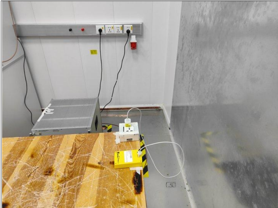
CONDUCTED EMISSION TEST -1