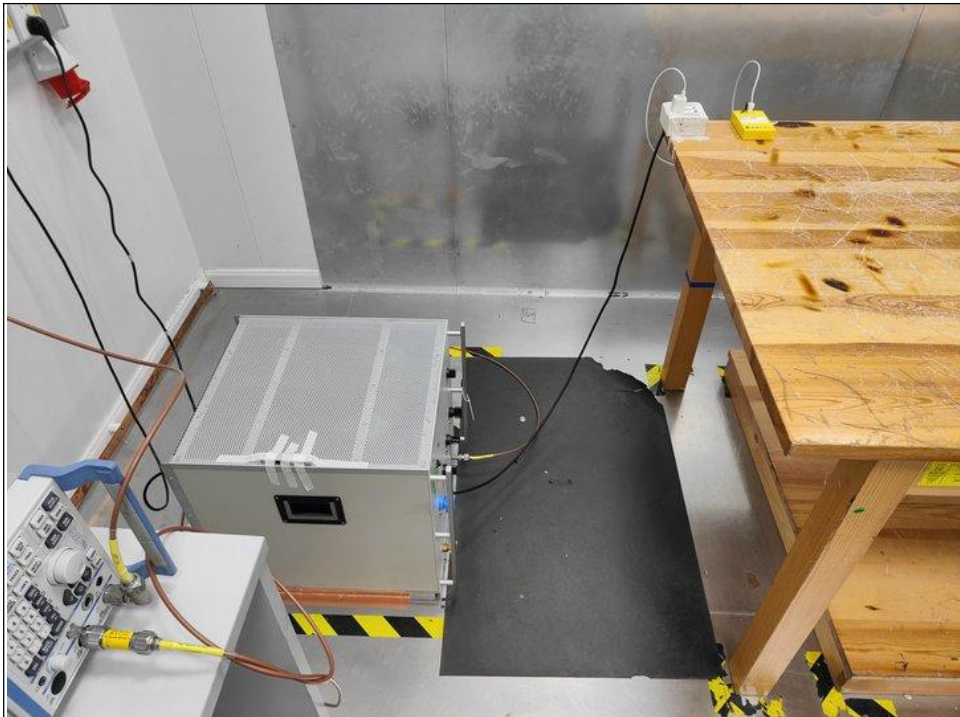
CONDUCTED EMISSION TEST -2