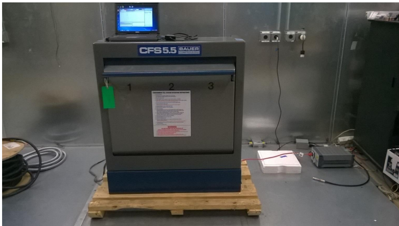
Figure 3 - Conducted Emissions Test Setup