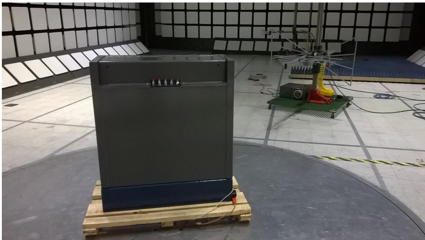
Figure 2 - Radiated Emissions Test Setup, 30MHz - 1GHz