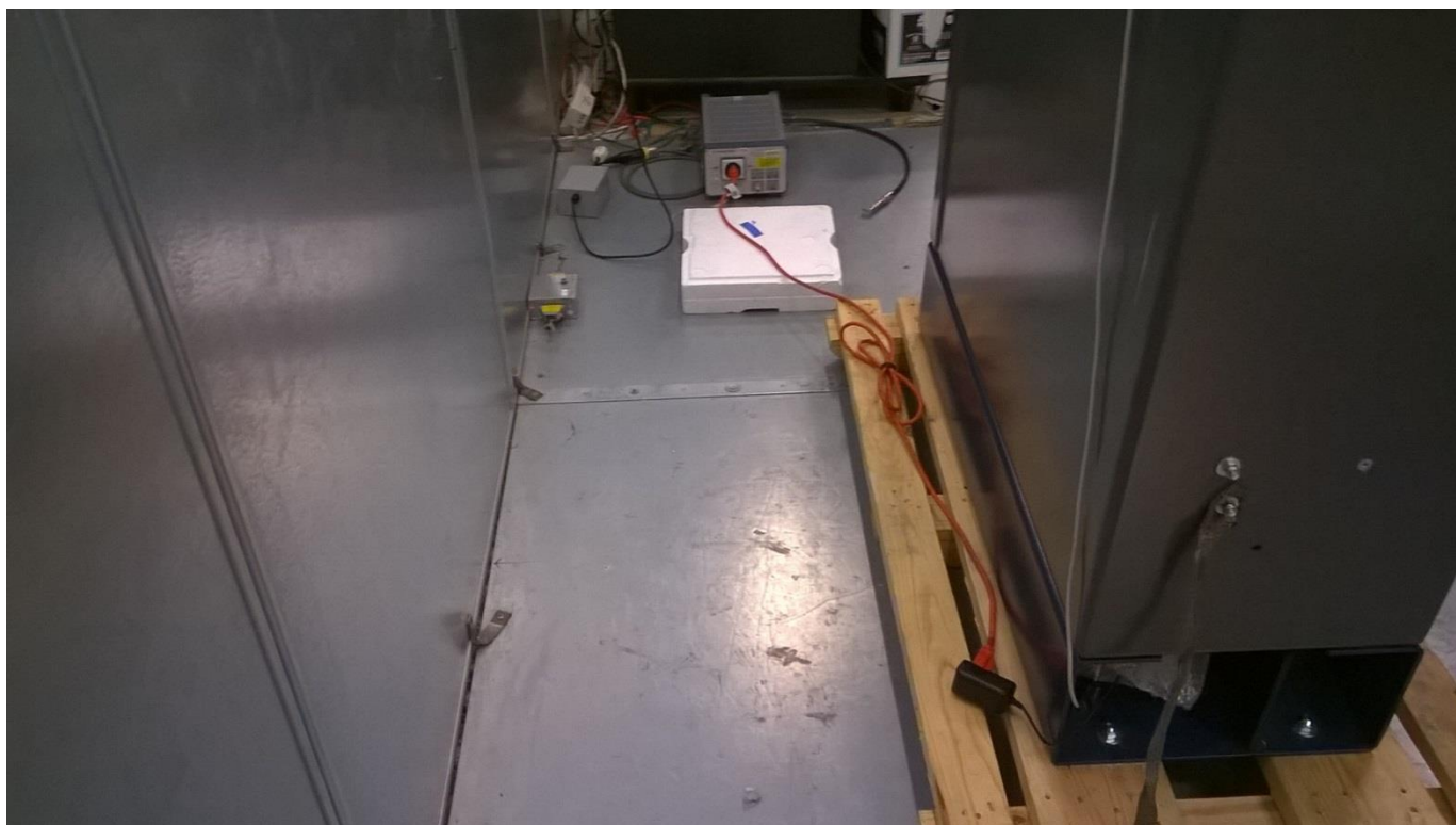
Figure 4 - Conducted Emissions Test Setup