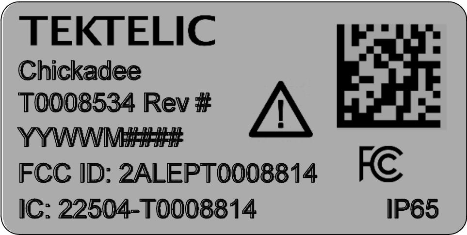
SENSOR, USB-C Charging