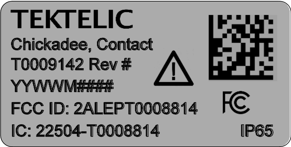
SENSOR, USB-C Charging OR Contact Charging