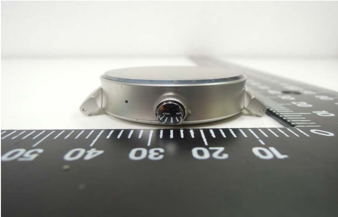
Front View of EUT (Model: QA08)