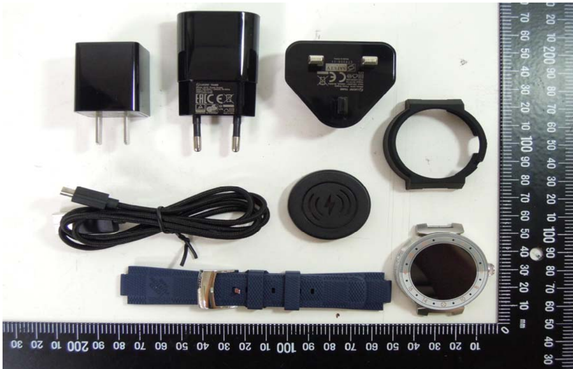
Front View of EUT (Model: QA05)