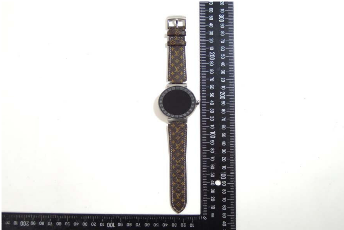
Front View of EUT-4