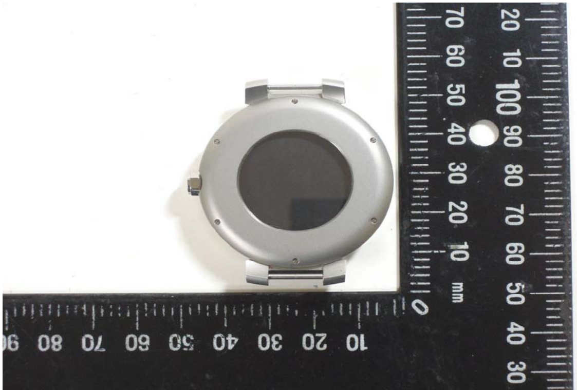
Back View of EUT - 2