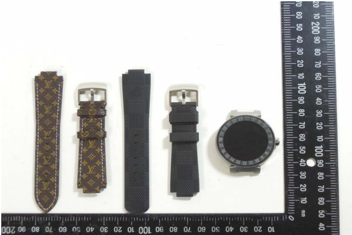
Front View of EUT-2